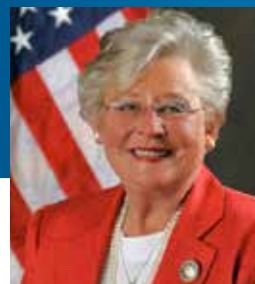
KAY IVEY Governor

Montgomery Regional Airport Commercial & Private ..... (334) 281-5040 Montgomery Aviation Private ..... (334) 288-7334