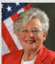
KAY IVEY Governor

ALABAMA DEPARTMENT OF TRANSPORTATION MONTGOMERY ALDOT FACILITY • 537 TRAFFIC OPERATIONS DRIVE