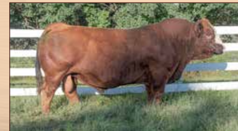
BEE ALPHA 915J - Service Sire to Lot 14