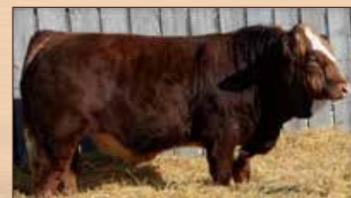
FSMB MILLENIUM 13M - Service Sire to Lot 26, 27 and 31