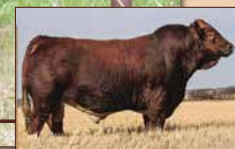
RUGGED R CAVILL - Service Sire of Lot 39