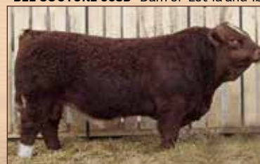
DOUBLE BAR D SPITFIRE 20X - Sire of Lot 1a and 1b