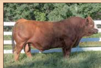
BEE ALPHA 915J - Sire of Lot 22 and 23