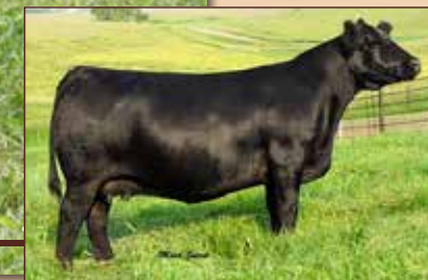
MISS WERNING KP 8543U - Maternal Grand Dam of Lot 18