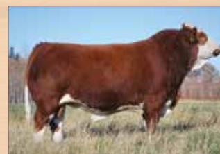
ANCHOR D VIPOR 103W Sire of Lot 10