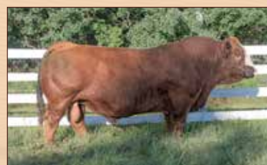
BEE ALPHA 915J - Service Sire to Lot 14 and 16