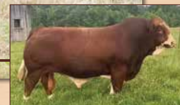
ESTES TOP GUN - Service Sire of Lot 38