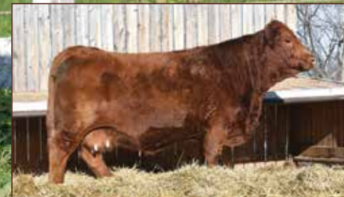
SKORS RED FORTUNE 176Y - Dam of Lot 14

Exposed to Bee Alpha 915J March 15/2025- April 26/2025, Observed bred April 1/2025 (safe). Exposed NAC Maverick 57M April 26/2025- June 6/2025.