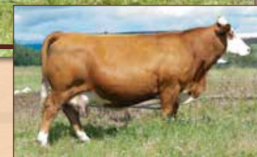
BLL EMILE 937G - Dam of Lot 13