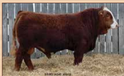
BLACK GOLD CRUDE - Sire of Lot 33

AI'd April 6 to Rugged R Cavill, No exposure. Ultrasound Due Jan 15