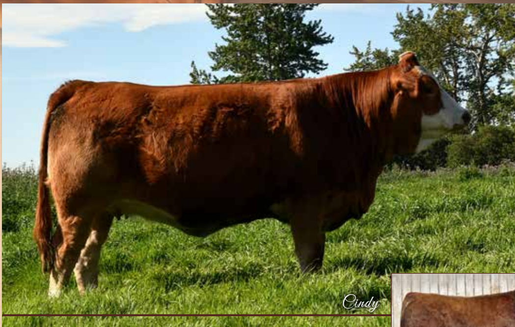
VIRGINIA JOURNEY 509K Sire of Lot 30 and 31

Bred Mar 30 to Rugged R Cavill; Exposed to FSMB MILLENIUM 13M April 1 - June 8 Vets opinion safe to AI date.