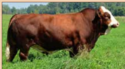
CITYVIEW GOLD TRIGGER - Service Sire of Lot 1