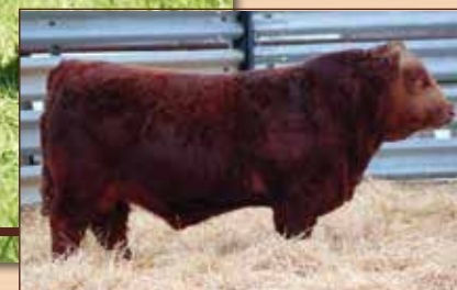
KWA CAN-AM 123H - Service Sire of Lot 17