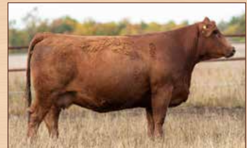
MISS R PLUS 0300H- Dam of Lot 19