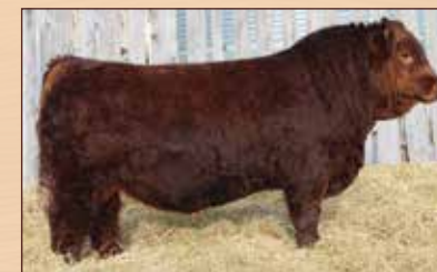
NAC MAVERICK 57M - Service Sire of Lot 15 and 18