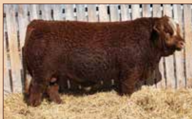
SKYWEST WARRIOR 101M Service Sire of Lot , 5, 7 and 11