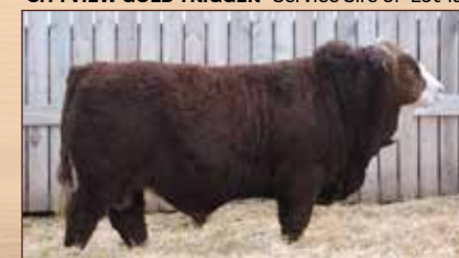
JNR QUANTUM - Service Sire of Lot 1b