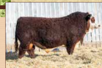
BLL RUMBLE 62H - Sire of Lot 3 and 4 Rumble 62H was the high selling bull in Canada at Beechnior Bros. 2023 Bull Sale selling for $355,000.

April 15/2025- May 20/2025. Exposed FSMB Lookout 4L April 10/2025- April 15/2025. Observed bred to FSMB Lookout April 11/2025 (safe)