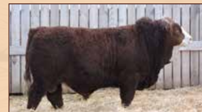
JNR QUANTUM - Service Sire to Lot 36