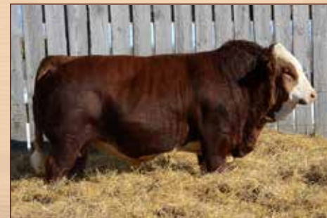
FSMB LOOKOUT 4L - Service Sire of Lot 6