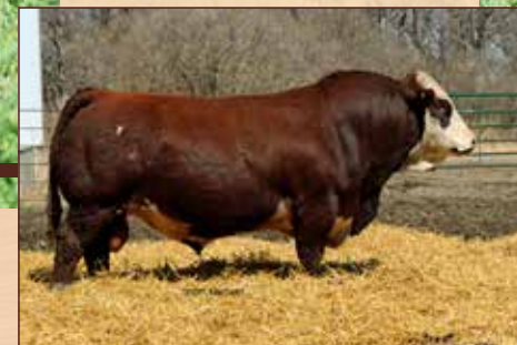
BLL BOURBON STREET 155J -Sire of Lot 6