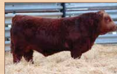
KWA CAN-AM 123H - Service Sire of Lot 17