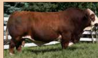
FGAF ELECTRIC AVENUE 140E Maternal Grand Sire of Lot 10