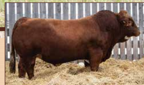
JB CDN SARCEE 2102 - Sire of Lot 37