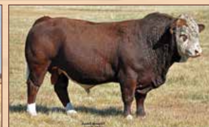
CENTURY HOOVER 5H - Sire of Lot 34