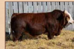
FSMB LOOKOUT 4L Service Sire of Lot 9