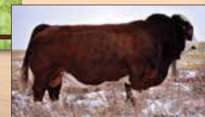
FGAF MAGNUM 901Z - Sire of Lot 8