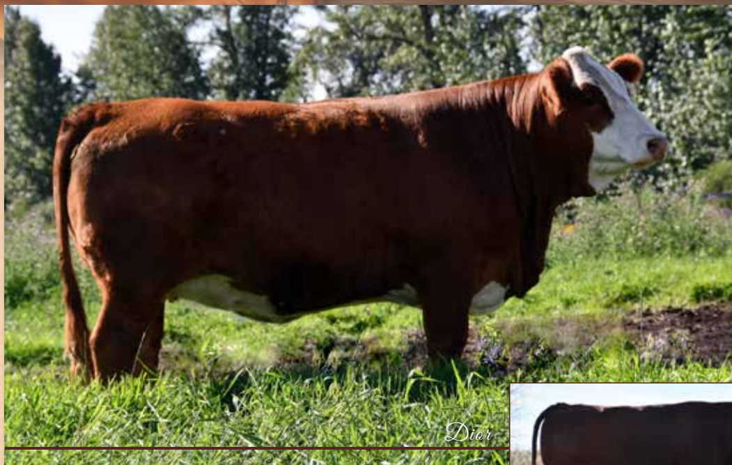
APPLECROSS DIANA 57E

Bred Mar 30 to Rugged R Cavill; Exposed to FSMB MILLENIUM 13M April 1 - June 8. Observed bred May 5th; Vets opinion safe to observed exposure date