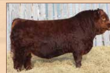
NAC MAVERICK 57M - Service Sire to Lots 22 and 23