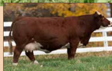
BEE COUTURE 663D - Dam of Lot 1a and 1b