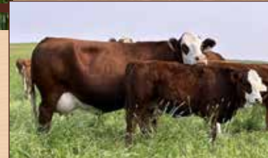
APPLECROSS DESTINY 50H - Dam of Lot 26 (with full Sib, Dazzle at side)