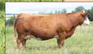
BLL FAITH 909G - Dam of Lot 8