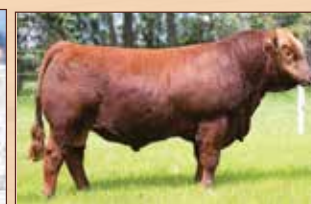
KWA CAN AM 123H Service Sire of Lot 41