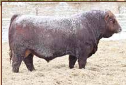
LFE RED WOOD 840H - Sire of Lots 24 and 25