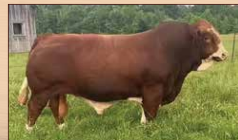
ESTES TOP GUN - Service Sire of Lot 37