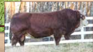
SIBELLE SUGAR RAY 25F - Sire of Lot 5