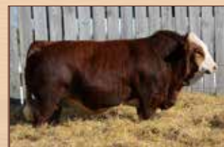
FSMB LOOKOUT 4L Service Sire of Lot 10