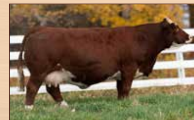
BEE COUTURE 663D- Dam of Crimson Tide

Owned with Johnson Ranching Offering 3 lots x 5 straw increments (CAN, US, AUS Qualified - Stored at Alta Genetics) 2a) 5 straws 2b) 5 straws 2c) 5 straws