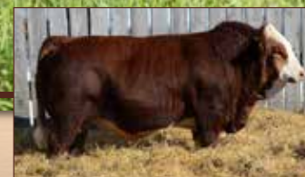
FSMB LOOKOUT 4L - Service Sire of Lot 8