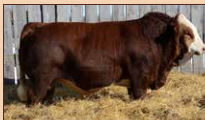
FSMB LOOKOUT 4L Service Sire of Lot 3, 6, 8, 9 and 10