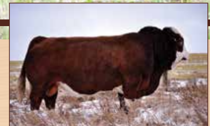
FGAF MAGNUM 901Z - Sire of Lot 32

AI'd April 4 to Rugged R Cavill, Exposed to Century Snides 418M April 13 to May 31. Ultrasound safe to AI due Jan 13.