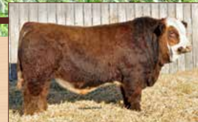
VIRGINIA JOURNEY 509K - Sire of Lot 29

Bred Mar 30 to Rugged R Cavill; Exposed to FSMB MILLENIUM 13M April 1 - June 8. Vets opinion safe to AI date.