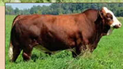
CITYVIEW GOLD TRIGGER - Service Sire of Lot 1a