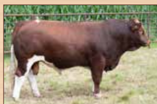
CENTURY SNIDES 418M Service Sire of Lot 40