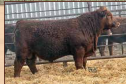
AEDJ TOP TIER 112L - Service Sire of Lot 25