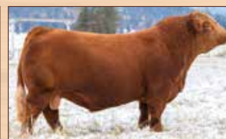
MADER WALK THE LINE 92J Sire of Lot 41