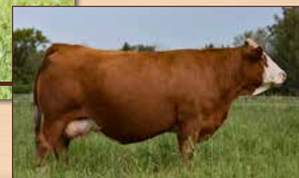
STBS SUSANNA 42F - Grand Dam of Lot 11

SQUARE HIPPED & BIG TOPPED square hipped & big topped