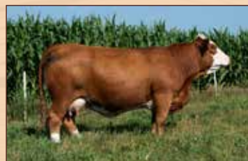
BLL CECE 952G - Dam of Lot 35