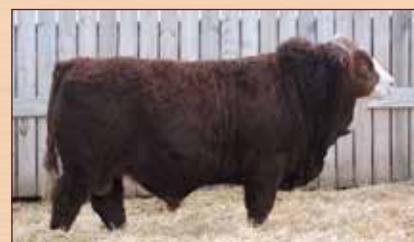
JNR QUANTUM - Service Sire of Lot 1a, 4, 12, and 13