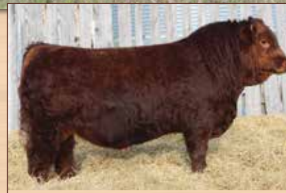
NAC MAVERICK 57M - Service Sire of Lot 24