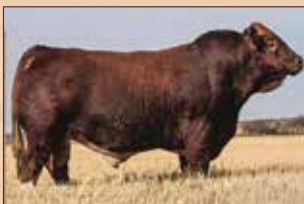
RUGGED R CAVILL Sire of Lot 40

AI'd April 8 to KWA Can Am 123H, Exposed to Century Snides 418M April 13 to May 31. Ultrasound safe to AI due Jan 17