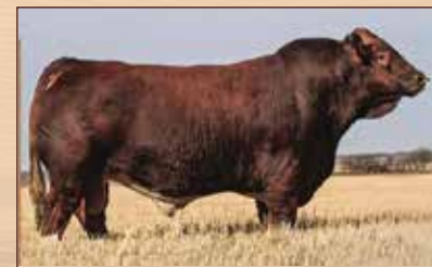
RUGGED R CAVILL - Service Sire to Lot 28, 29 and 30