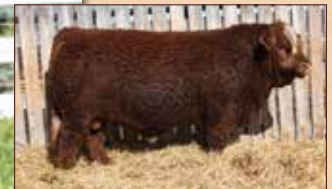
SKYWEST WARRIOR 101M Service Sire of Lot 5