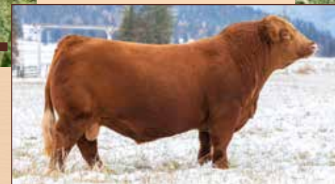
MADER WALK THE LINE 92J - Sire of Lot 14