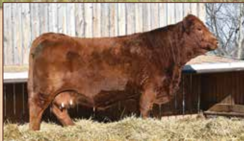
SKORS RED FORTUNE 176Y - Dam of Lot 21, 24 and 25