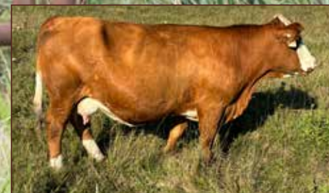
ANCHOR D JEIDRA 669J - Dam of Lot 37

AI'd March 23 to Estes Top Gun, Exposed to Century Snides 418M April 13 to May 31. Ultrasound safe to AI due Jan 2