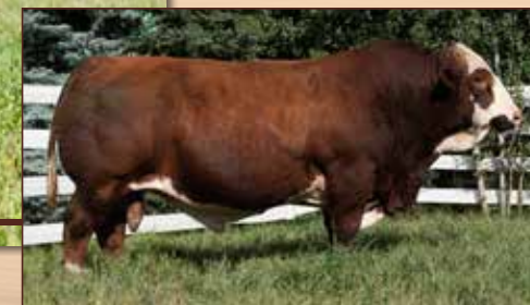
FGAF ELECTRIC AVENUE 140E - Sire of Lot 11, 12 and 13