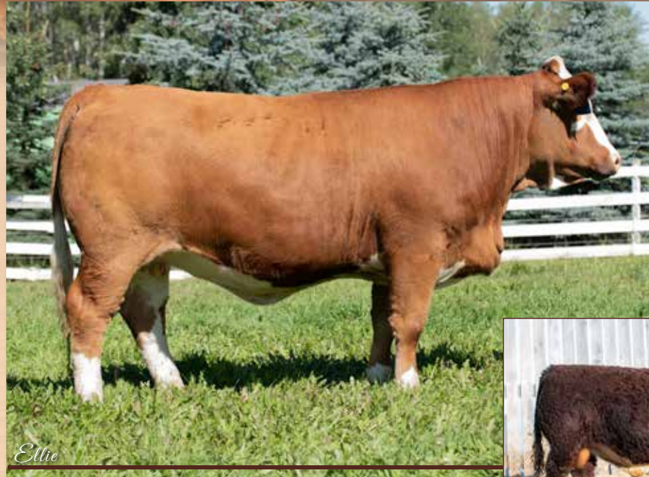
BLL RUMBLE 62H - Sire of Lot 3 and 4 Rumble 62 was the high selling bull in Canada at Beechnior Bros. 2023 Bull Sale selling for $355,000.

April 15/2025-May 20/2025. Exposed FSMB Lookout 4L April 10/2025- April 15/2025.