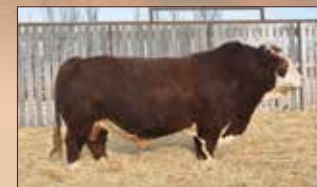
FSS POLLED HENDRIX Sire of Lot 9