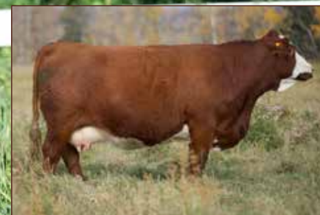
BEE CROCUS 564C - Grandam of Lot 6