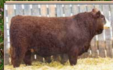
BLL TOMBSTONE 223K - Sire of Lot 26 & 27