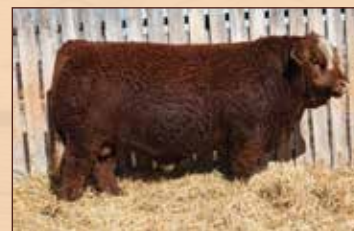
SKYWEST WARRIOR - Service Sire to Lot 35