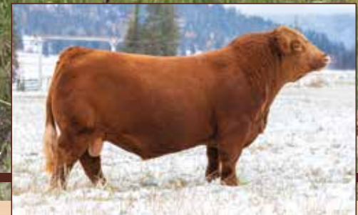
MADER WALK THE LINE 92J - Sire of Lot 19