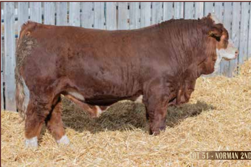
LOT 51 - NORMAN 2ND

1520341 / MJB 68N / Feb 10, 2025 / Fullblood