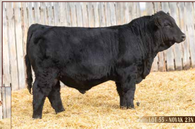
LOT 55 - NOVAK 23N

BPG1520325 / JDS 23N / Jan 23, 2025 / Polled Black Purebred