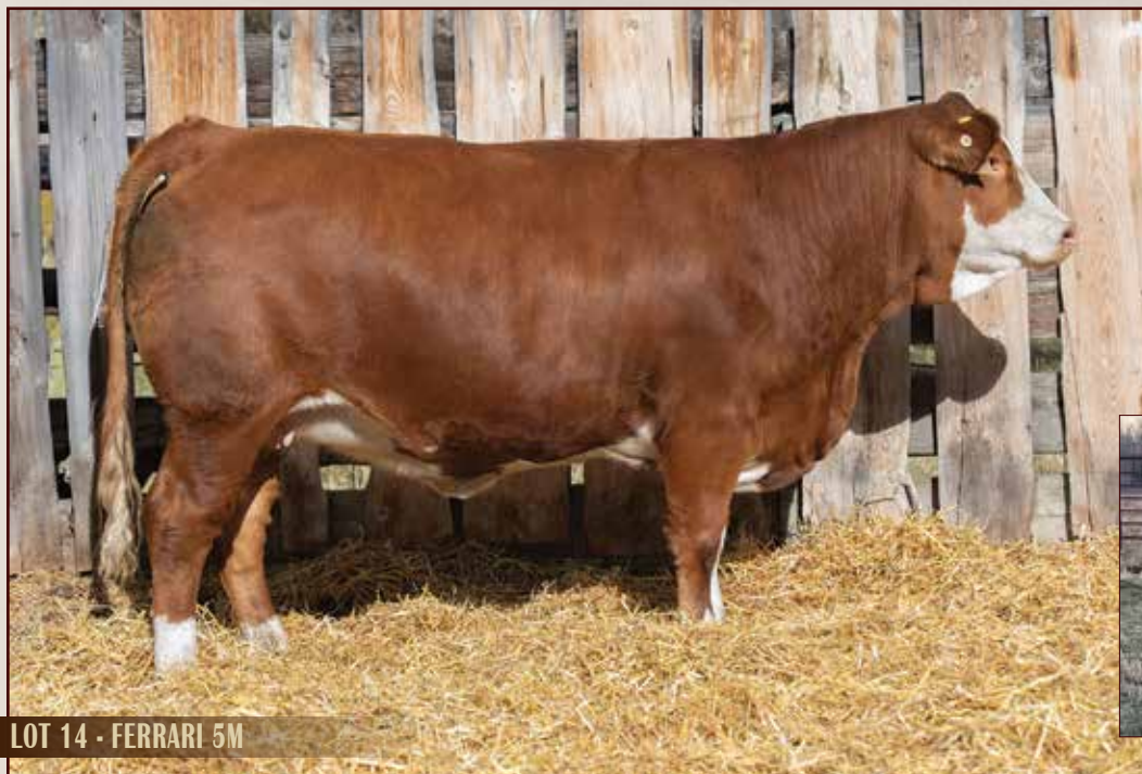
LOT 14 - FERRARI 5M

BEE BATTLE CRY 282B MJB MISS DORRIT 4D SILVER LAKE LAGACY MVS MARIE