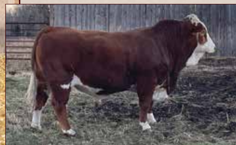
MTV MAUREY 5L- Service Sire of Lot 14

A-I bred Anchor D Outlook April 4 2025. Exposed to MTV Maurey 5L April 20 – June 28, 2025. Safe to exposure.