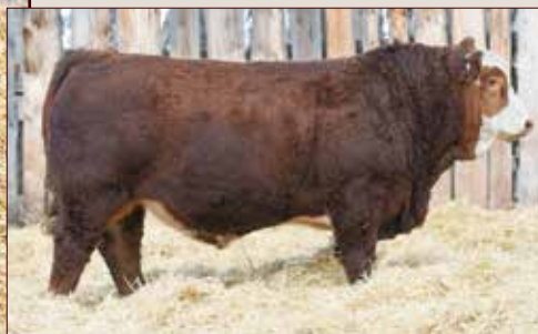
MTV KARLSBURG 3J - Sire of Lots 65, 66, 67 and 69