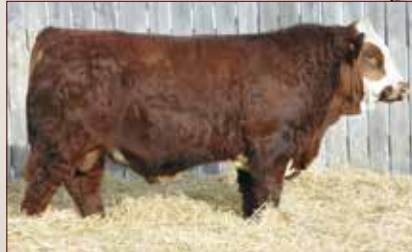
VIRGINIA RADISON 5Z - Sire of Lot 43