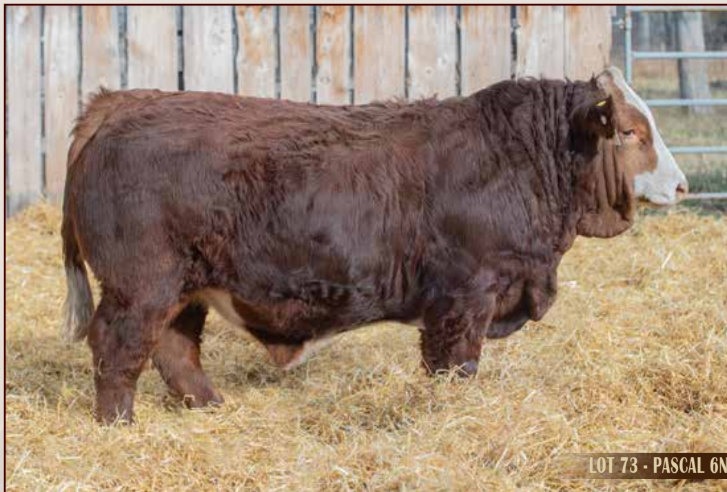
LOT 73 - PASCAL 6N