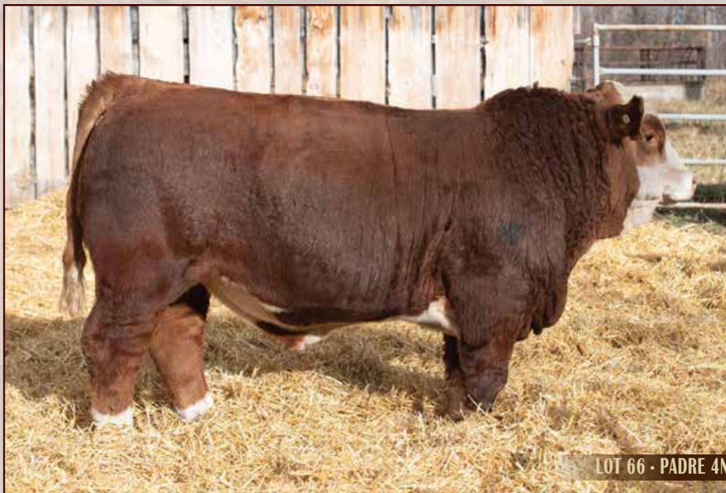
LOT 66 - PADRE 4N

SIBELLE VICKING 35B VIRGINIA MS SUZIE VIRGINIA KENT 1X MTV BELLE 1J