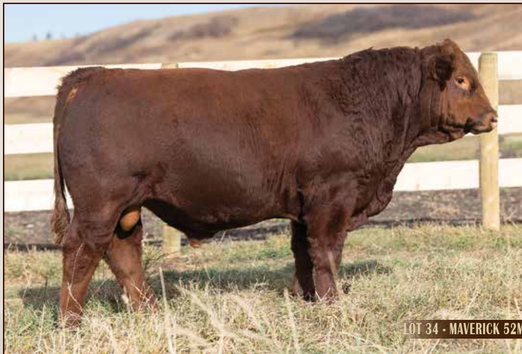
LOT 34 - MAVERICK 52M