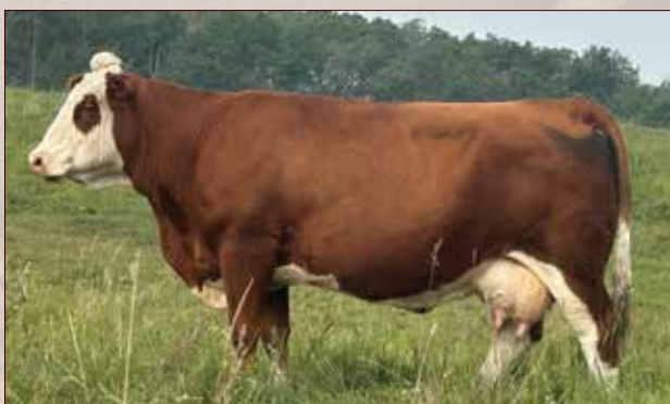
JB CDN SENORITA 1754 - Dam of JB CDN SOLDIER 2426