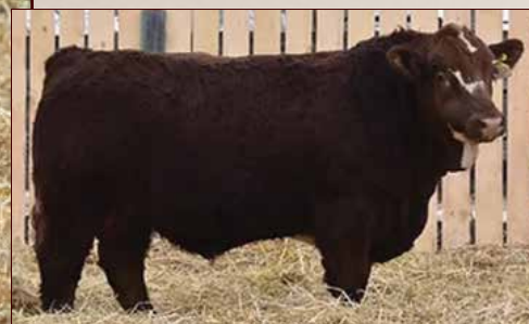
CROSSROAD PILOT 21H - Sire of Lot 70 and 72