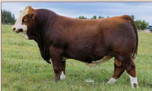
JB CDN BLACKFOOT CROSSING 2332 - Maternal brother of JB CDN THE NASH 2414