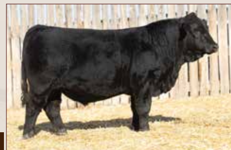
JLD CAPACITY 1L - Full brother to lot 57 sold in 2022

This bull brings performance and presence wrapped up in a red package with a true blaze that'll catch your eye every time. An ET calf out of our leading donor cow, he carries the depth of pedigree and consistency that define our program. He's stout made and solid right through, with the kind of muscle expression and dimension that speak to real-world power. Moderate in frame but big on substance, he balances performance and practicality perfectly. Full brothers in a black hide have topped this sale for us in previous years, and this red edition follows right in their footsteps — offering the same power, predictability, and style in a fresh package.