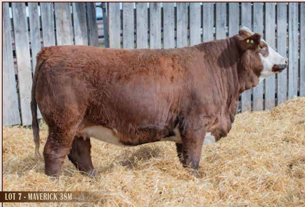
LOT 7 - MAVERICK 38M