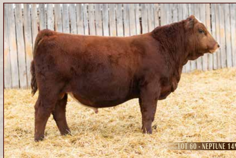
LOT 60 - NEPTUNE 14N

MRL RED WHISKEY 101B SVS RED SARA 92X ACS EVERREADY 970W 3D MISS RED NOREMAC 211U TNT TOP GUN R244 MS MAXIE LOU M112S CLO LTS ENTOURAGE 72T JF EBONYS JOY 702T