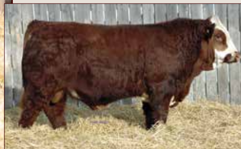
VIRGINIA RADISON 5Z - Service Sire of Lot 3 and 5

AI bred to Virginia Radison 5Z -773557- March 27,2025. Exposed to MJB Lucas 24L -1440767- April 11,2024 - June 01,2025. Confirmed pregnant to AI breeding.