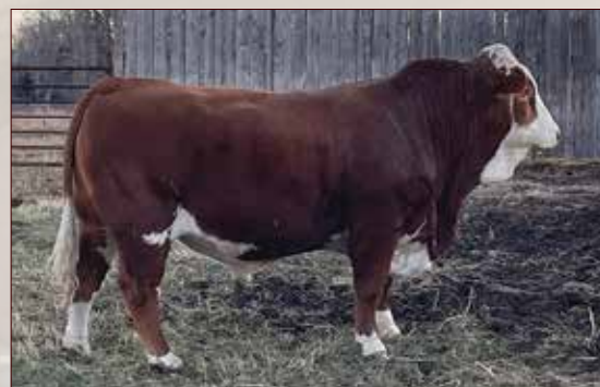
MTV MAUREY 5L - Sire of Lot 73

A special Thank You to all of our bidders and buyers over the years. The growth we have seen in our programs is because of the support from all of you! Join Us for a Delicious Prime Rib meal on Sale Day!