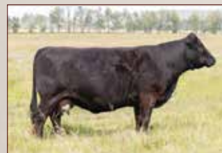
R AND R MILKMAID 74C Dam of Lot 15