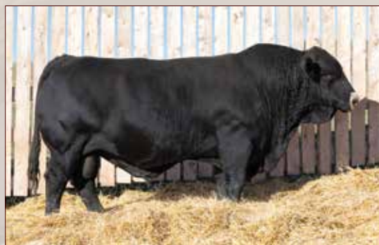
WHR FERDINAND 44F- Sire of Lot 77