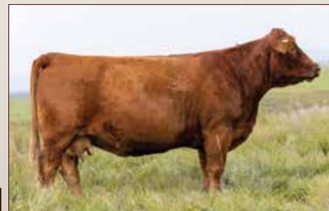
R AND R MILKMAID SMTR 4F - Dam of Lot 34

TNG MAVERICK 52M has some presence to him — bold, proud and built right. He's thick where he should be, smooth on the move and has that balanced, easy-to-like profile. His maternal side goes back to Hooks Shear Force 38K, which is known for making cows that last, milk well and stay sound. If your goal is replacement females with body, softness and no fuss, Maverick fits that lane really nicely.