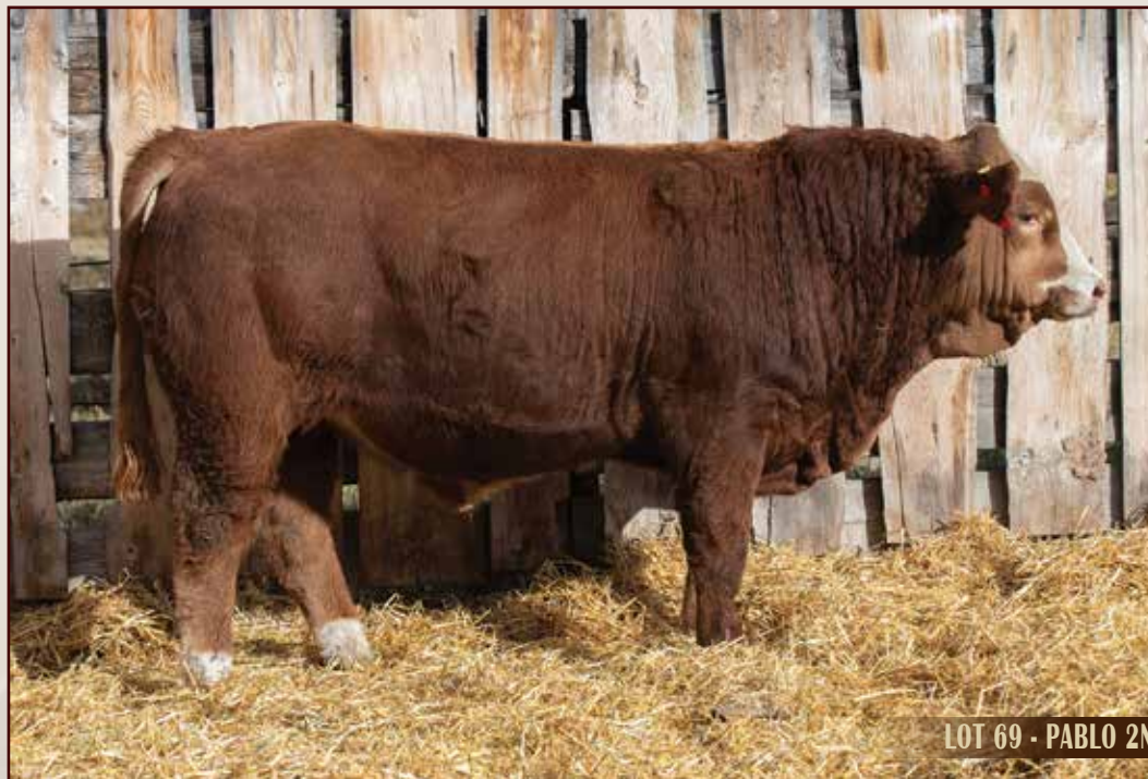
LOT 69 - PABLO 2N