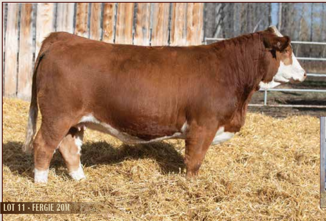
LOT 11 - FERGIE 20M