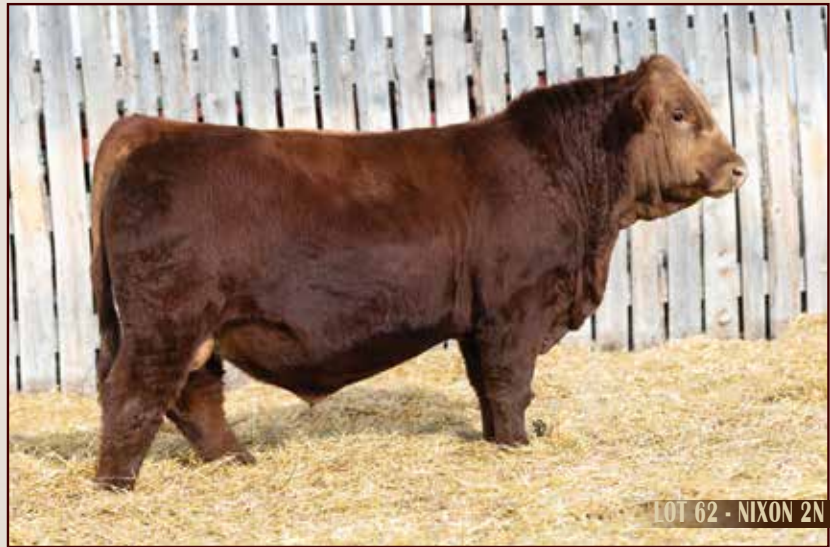
LOT 62 - NIXON 2N

PG1520310 / JDS 2N / Jan 1, 2025 / Polled Red Purebred