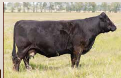
R AND R MILKMAID SMTR 74C - Granddam of Lot 30

TNG MILES 84M has that straightforward look to like. He's bold through his rib, wide over his top, and has that balanced, square look that's really hard to pick apart. He's sired by CLRWTR Clear Advantage H4G, a bull known for adding muscle and dimension while keeping cattle sound and manageable. His dam, 46F, traces back to Dikemans Double Down 26W on both sides of her pedigree — so maternal consistency, udder quality, and that soft, easy-doing style runs deep here. This is the kind of cow family that quietly works and lasts. If you like cattle that stay in good shape and look good doing it, 84M is your guy.