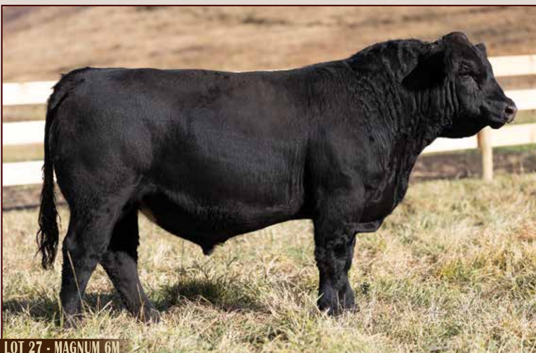
LOT 27 - MAGNUM 6M

Brenda & Brekell Otto 120- 32011 354 Ave W Foothills, AB T1S 7A1 Brenda Cell: 403-818-3142 Brekell Cell: 403-312-9799 Email: BOTOtto@trranch.ca