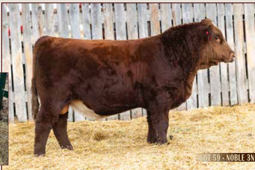
LOT 59 - NOBLE 3N

PG1520313 / JDS 3N / Jan 1, 2025 / Polled Red Purebred