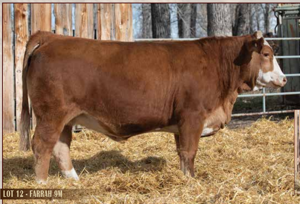
LOT 12 - FARRAH 9M