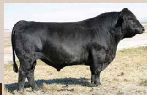
HOOK'S BEACON 56B - Sire of Lot 29

TNG MARIO 57M is a super easy bull to appreciate. He's deep-sided, soft made, and has that chill, low-maintenance look we all love. He's sired by Hook's Beacon 56B, who's known for making good-natured cattle that feed well and leave daughters with really nice udders. His dam, 35J, comes out of a cow family we trust big time. She traces back to CCR Cowboy Cut 5048Z and Dikemans Double Down 26W—so you get that mix of maternal strength, longevity, and cows that just work without any headaches. It's the kind of cow family you wish you had more of. If you're needing a black bull that's practical, sound, and the kind you'll want to keep daughters out of—57M is an easy choice.