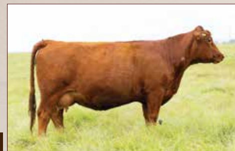
R AND R MILKMAID SMTR 3J - Dam of Lot 35

TNG MONROE 35M has always been one of those bulls that just feels right. He's balanced, good in his structure and has a nice, honest build to him. On the dam side, he goes back to Beckton Nebula, which brings the quiet temperament and fertility this line of cows is known for. He's the kind you turn out and don't think twice about — and you'll really like the daughters.