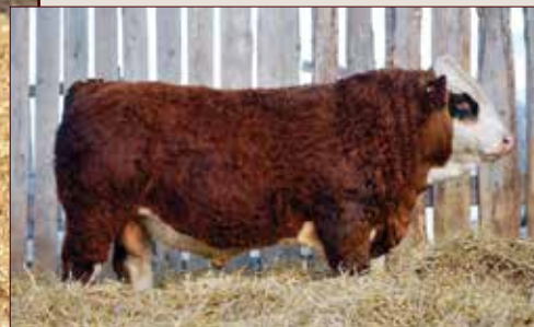
BEE NORSE 46D - Maternal Grandsire of Lot 11

A-I bred Virginia Radison Aril 4, 2025. Exposed to MTV Maurey 5L April 20 – June 28 2025. Ultrasound safe to A-I date on June 9.