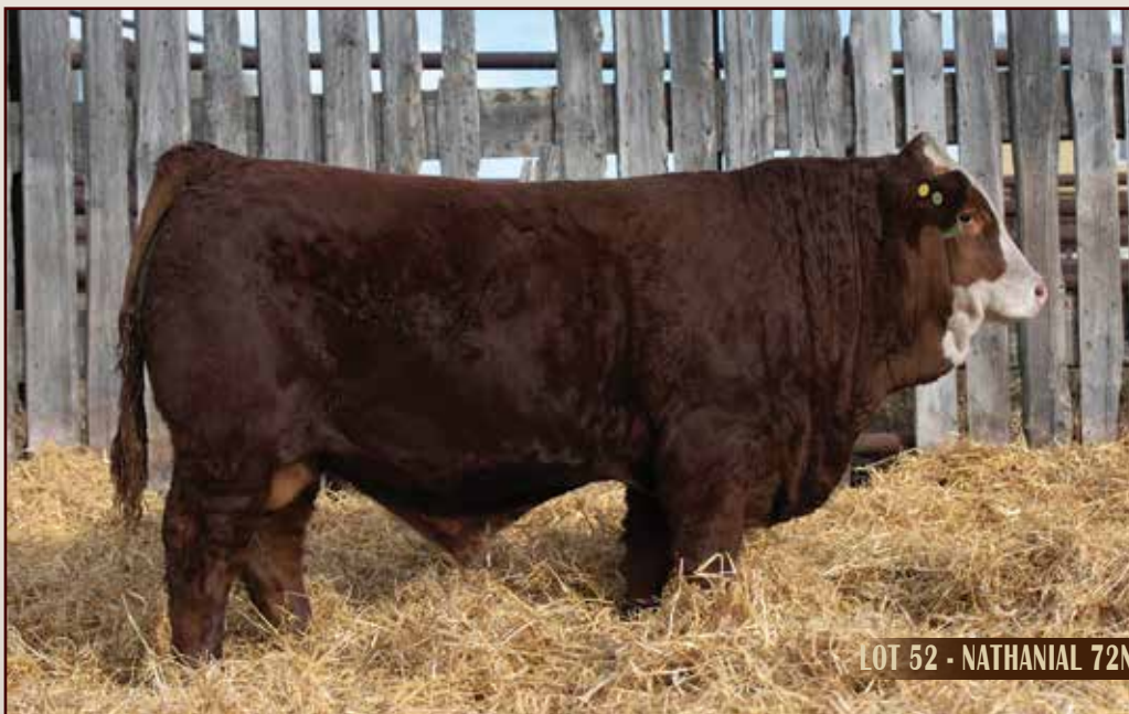
LOT 52 - NATHANIAL 72N