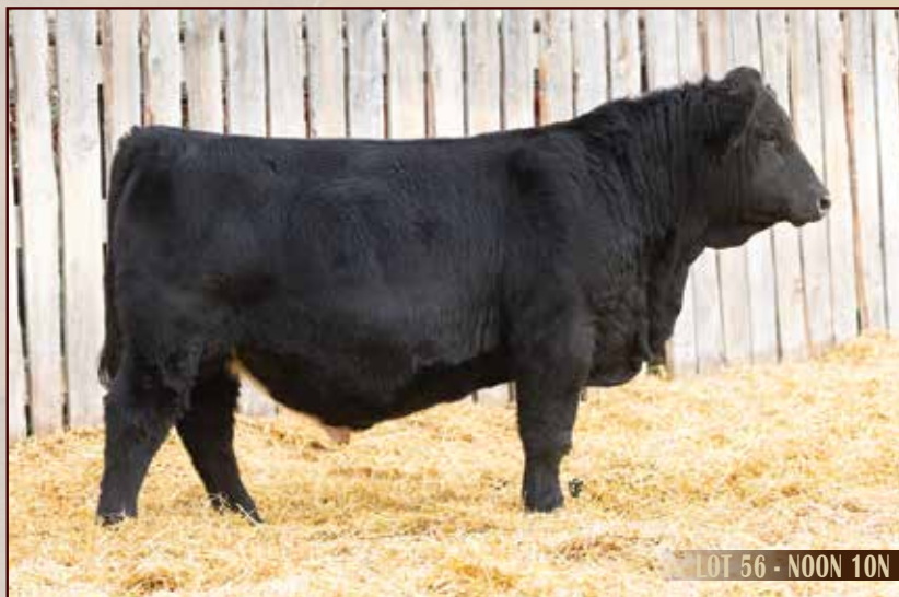
LOT 56 - NOON 10N

A true performance bull in a sleek black package, this ET calf carries the depth and consistency that define our donor program. This calf came with some extra birthweight as ET calves usually do but we are confident that he won't breed this way. If this bull interests you but his birthweight isn't in your comfort zone, please reach out to us. Deep-sided, stout, and long-bodied, he's built for growth and functionality — the kind of bull that will stamp his calves with performance and power. He combines eye appeal, muscle, and soundness. A bull that will leave his mark on both your herd and your bottom line.