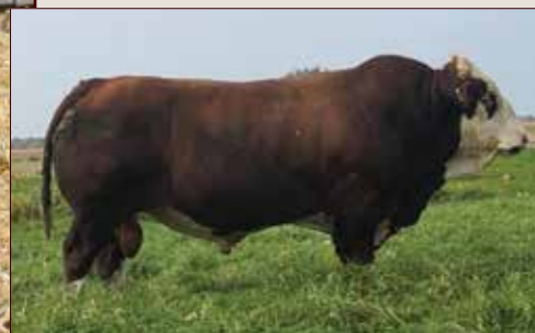
BMS POL ATLANTIS 40E - Sire of Lot 71