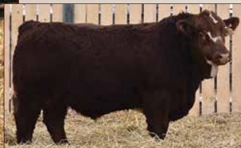
CROSSROAD PILOT 21H - Service Sire of Lot 12 and 13

A-I bred Crossroad Pilot 21H April 4 th . Exposed to MTV Maurey 5L April 20 – June 28, 2025. Ultrasound safe to A-I on June 9th.