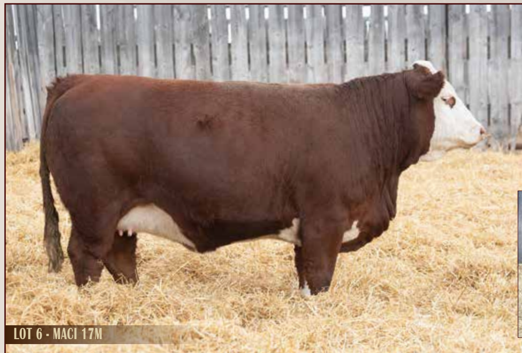
LOT 6 - MACI 17M