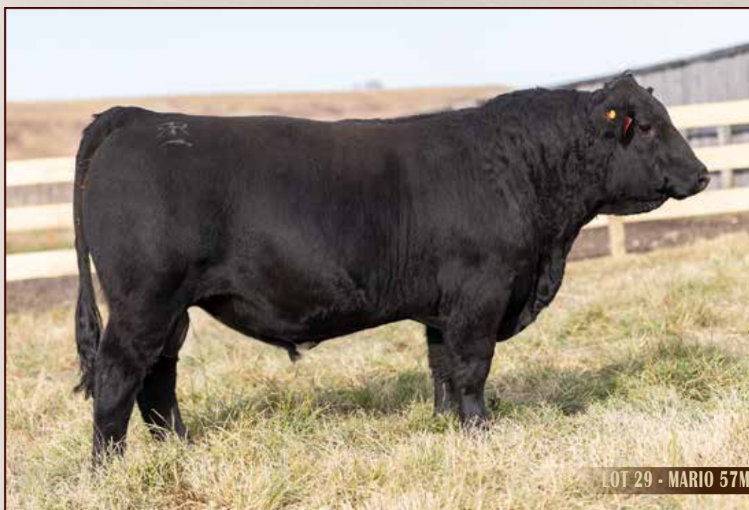
LOT 29 - MARIO 57M