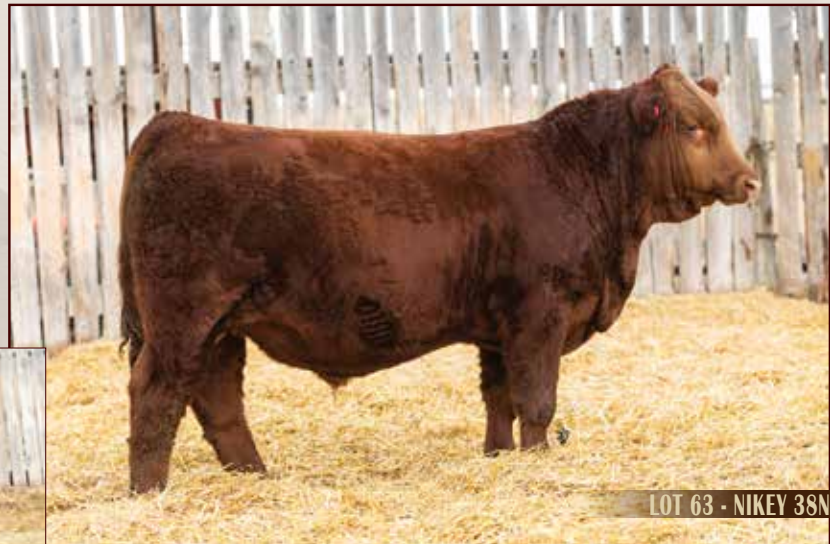
LOT 63 - NIKEY 38N

PG1520561 / JDS 38N / Feb 25, 2025 / Polled Red Purebred