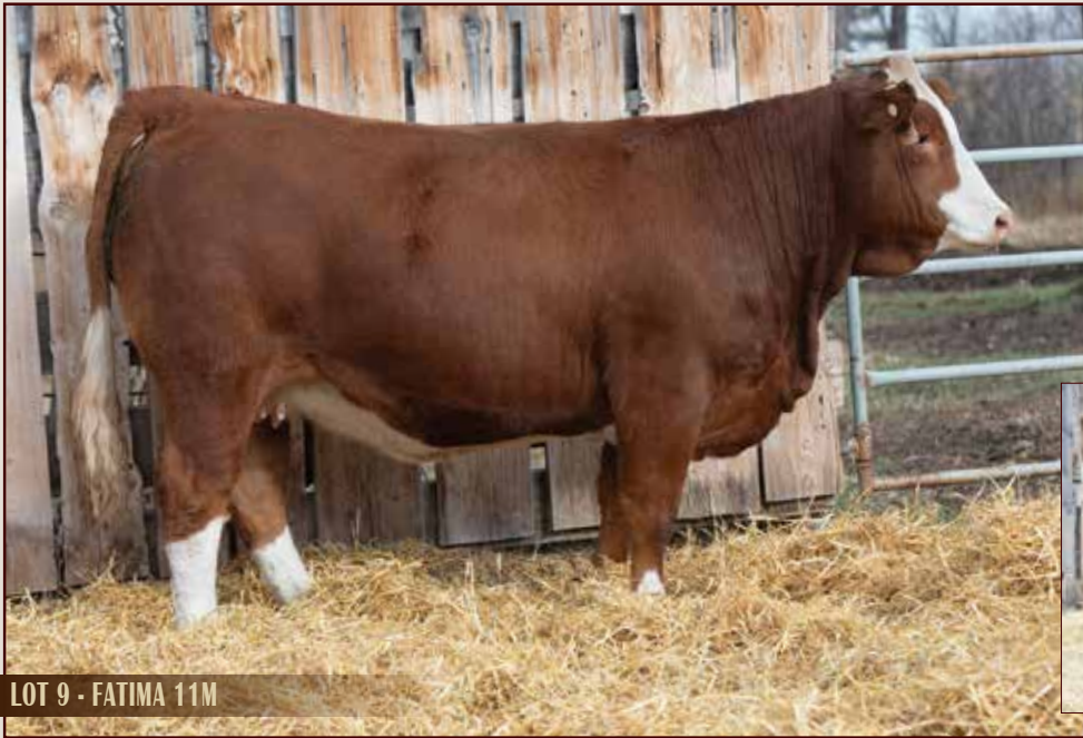
LOT 9 - FATIMA 11M