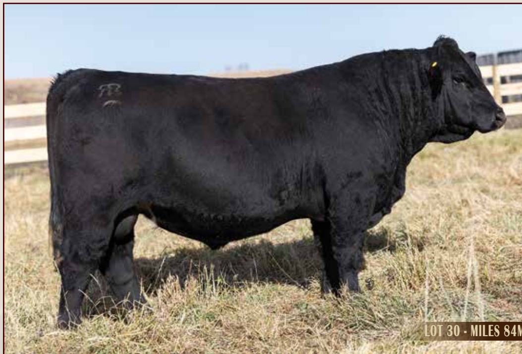
LOT 30 - MILES 84M