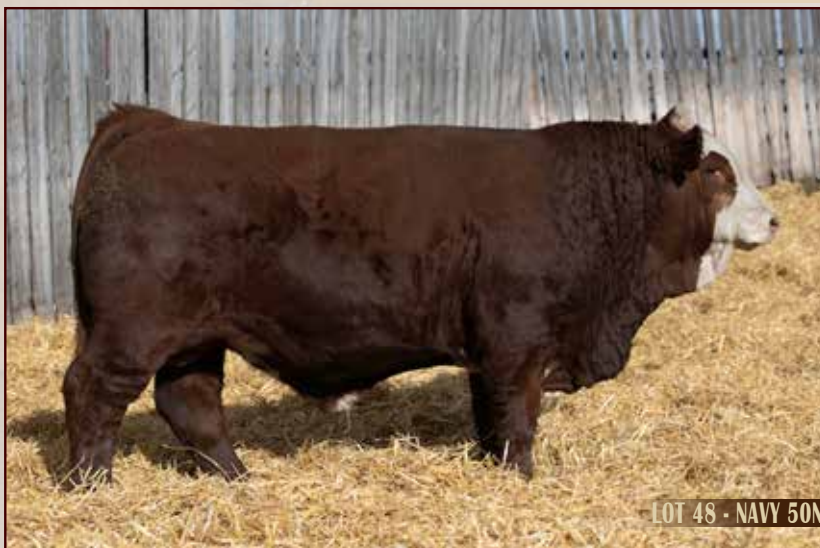
LOT 48 - NAVY 50N

1519573 / MEB 50N / Jan 28, 2025 / Fullblood