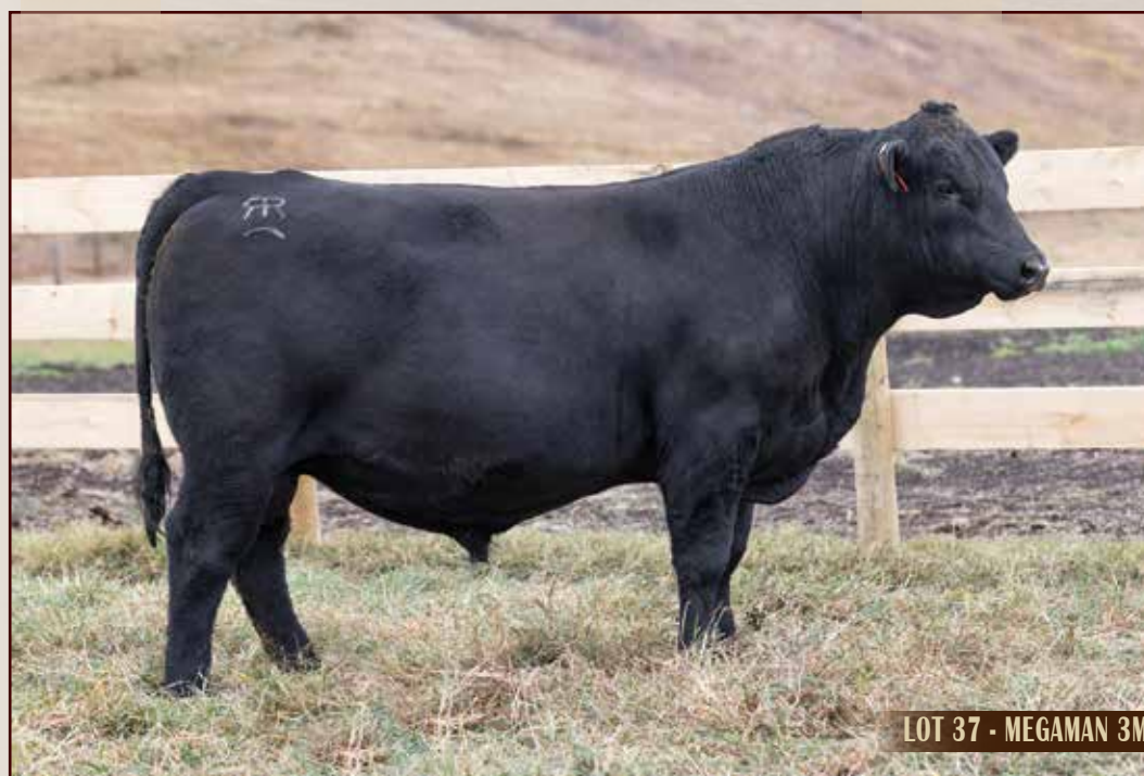
LOT 37 - MEGAMAN 3M

TNG MEGAMAN 3M is a big, good-looking boy with all the shape and muscle you could ask for. He's wide topped, deep bodied and has that powerful but easy-going look we really appreciate. Sired by Poss Winchester for added growth and muscle. His dam comes from the Joette cow family, known for great udders and long-lasting females. 3M will sire calves with shape and style and leave you daughters you'll want to keep every time.