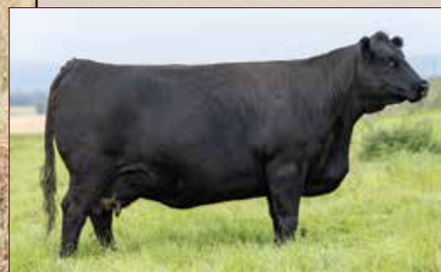
DH EULIMA 802 - Dam of Lot 18

AI Bred on June 5 th to PM EXECUTIVE DECISION 5'17 (CAA 1969967) Confirmed safe. Due Date: March 14 th 2026