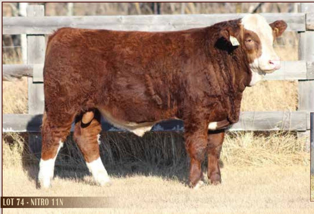
LOT 74 - NITRO 11N

This calf was a looker right from the time he hit the ground! He has since matured into a big, strong, heavy haired herdbull prospect. 11N is out of a "Full Moon" first time calver heifer that is showing exceptional maternal instincts and udder quality. A true heifer bull with a moderate birthweight and a pedigree full of calving ease. Nitro 11N ranks in the top 25% in the breed for calving ease EPDs. Built for real range conditions with sound structure, solid movement, and the durability to travel and thrive in any environment. "Nitro" was the highest weaning weight of the pen. And has kept that pace up post weaning doing 4.4 per day on test! Check him out!