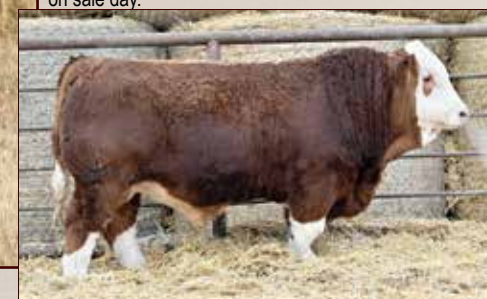
KSL LUKE 70L - Sire of Lot 75

Homo Polled test and Dilutor test pending. Results available on sale day.