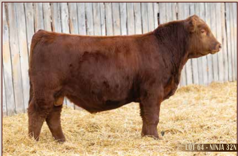
LOT 64 - NINJA 32N

PG1520328 / JDS 32N / Feb 6, 2025 / Polled Red Purebred