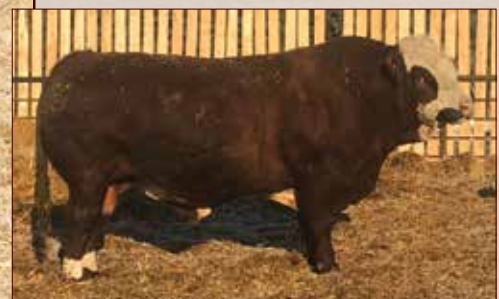
BEE BATTLE CRY 282B - Sire of Lot 2 Service Sire of Lot 6 and 8

AI bred to SJFB Moll 5W-160059 - March 27,2025. Exposed to MJB Lucas 24L-1440767 April 11-June 01,2025. Pregnant to AI breeding