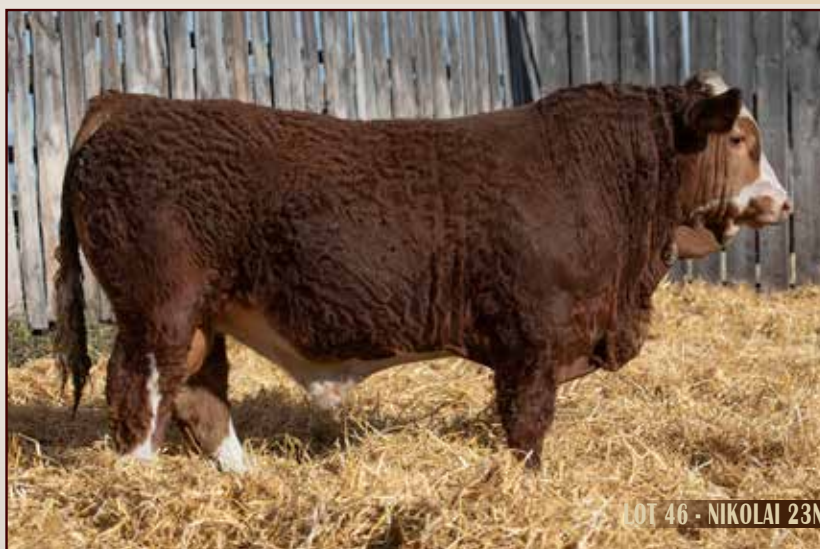
LOT 46 - NIKOLAI 23N

1520346 / MEB 23N / Jan 13, 2025 / Fullblood