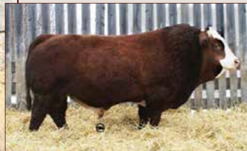
RWR SULLY 9E - Sire of Lot 74

Dilutor test pending. Results available on sale day.