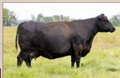
JMB JOETTE 8189 - Dam of Lot 37

TNG MEGAMAN 3M is a big, good-looking boy with all the shape and muscle you could ask for. He's wide topped, deep bodied and has that powerful but easy-going look we really appreciate. Sired by Poss Winchester for added growth and muscle. His dam comes from the Joette cow family, known for great udders and long-lasting females. 3M will sire calves with shape and style and leave you daughters you'll want to keep every time.