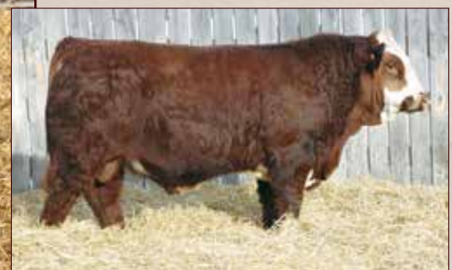
VIRGINIA RADISON 5Z - Service Sire of Lots 9, 10 and 11

A-I bred Virginia Radison April 4, 2025. Exposed to MTV Maurey 5L April 20 – June 28, 2025. Ultrasound safe to A-I date on June 9.