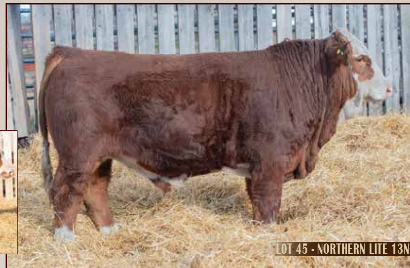
LOT 45 - NORTHERN LITE 13N