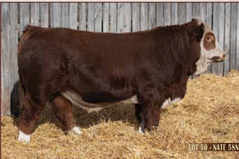
LOT 50 - NATE 58N

P1520361 / MJB 58N / Feb 4, 2025 / Polled Fullblood