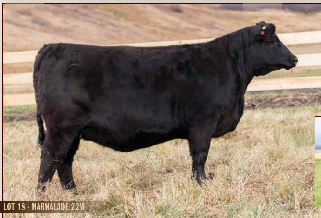
LOT 18 - MARMALADE 22M

CHERRY CREEK LAND GRANT BRESHE OF CONANGA 6988 POSS EASY IMPACT 0119 POSS BLUEBLOOD 920 CRA BEXTOR 872 5205 608 G A R OBJECTIVE 1885 PA4D BANDO SUPREME J2D RAQUEL MORRIE