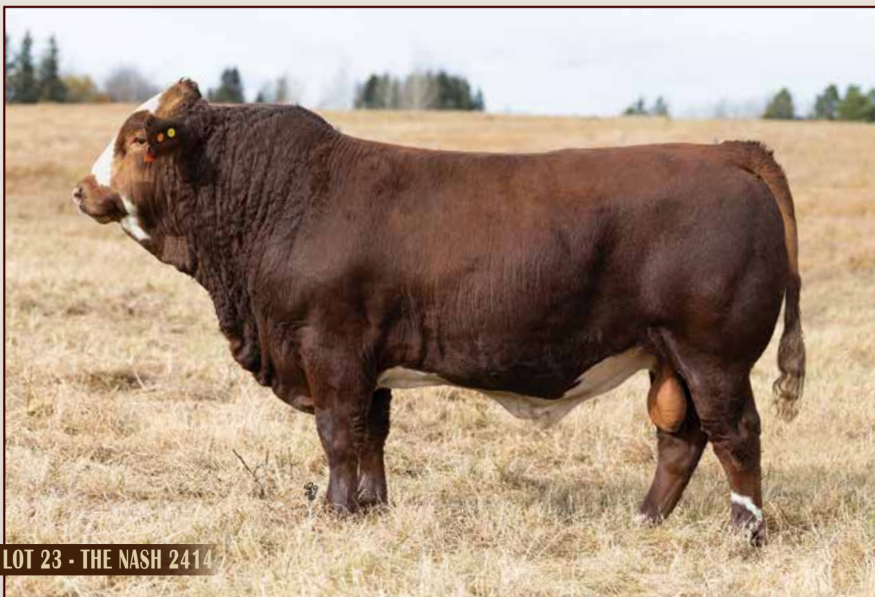
LOT 23 - THE NASH 2414