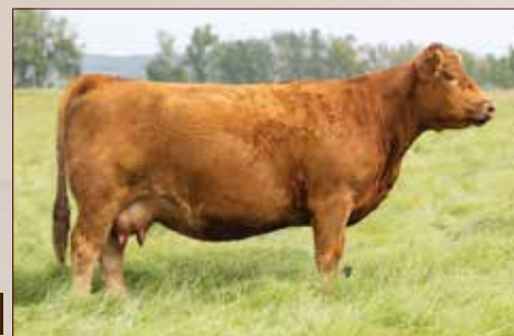
R AND R MILKMAID 15J - Dam of Lot 31

TNG MILO 70M is one of those bulls that's effortlessly impressive — he's smooth-made, good shouldered, and has that soft look through his rib and flank. Both his sire and his dam trace back to Hooks Shear Force 38K, so the structure, disposition, and longevity are backed in from both sides. His dam, 15J, is red, which makes 70M heterozygous black — so depending on what you turn him out with, you'll have the option to get both colors in the calves. Just a nice, versatile bull that will fit a lot of different programs.