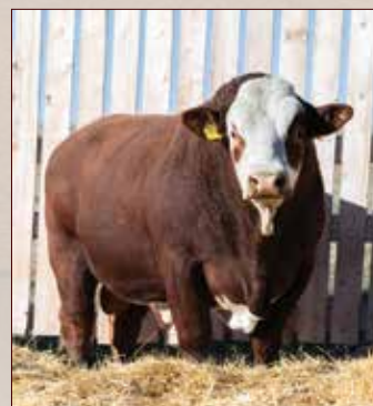
WAGNERS LINCOLN 548L Sire of Lot 76