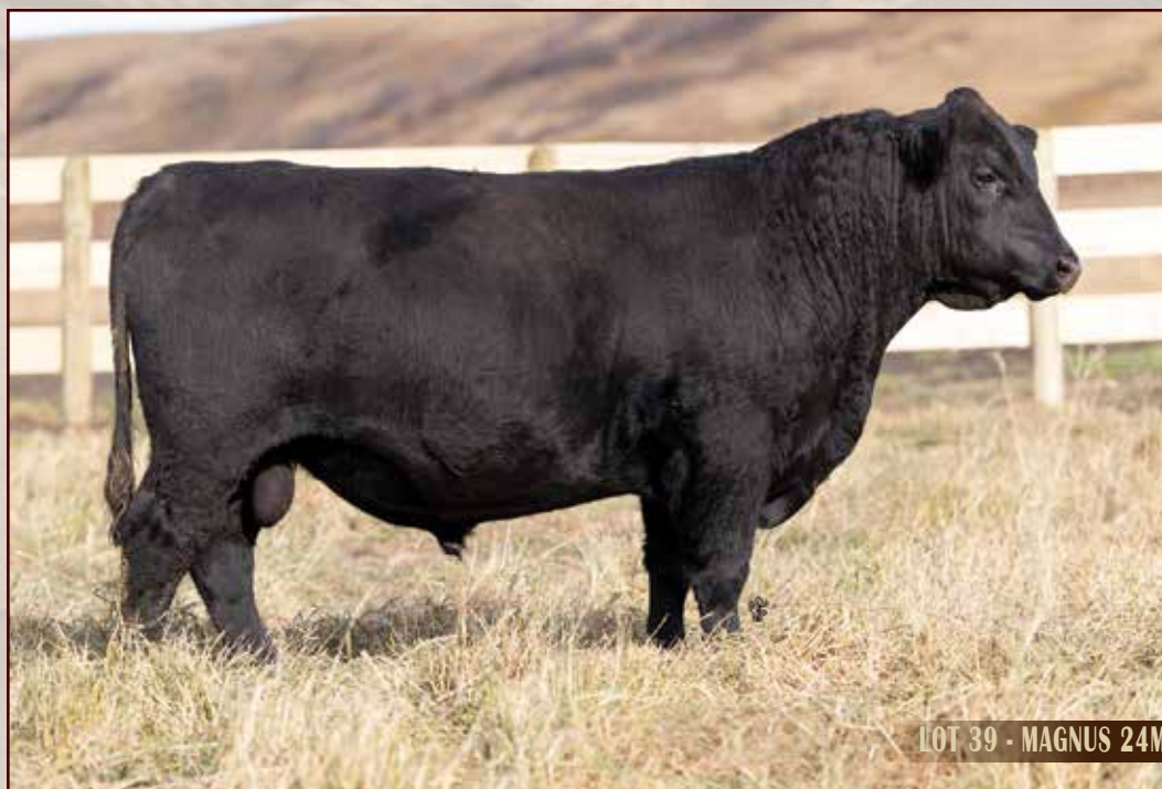
LOT 39 - MAGNUS 24M

CHERRY CREEK LAND GRANT BRESHE OF CONANGA 6988 POSS EASY IMPACT 0119 POSS BLUEBLOOD 920 ELLINGSON PLATEAU 1155 E A BLACKCAP 0360 S A V BISMARCK 5682 JMB EONA 547