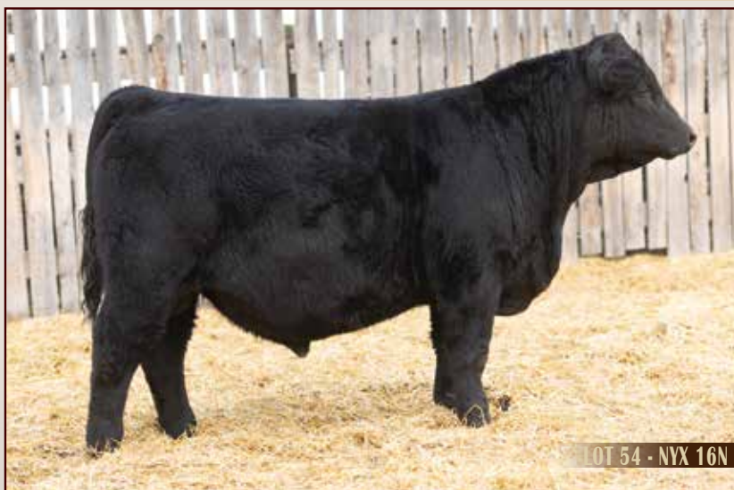
LOT 54 - NYX 16N

A black calf full of style and muscle, this Caliber son is built to add pounds and performance to any calf crop. Out of a dam going back to Lotto, a cow that never misses for us, he carries consistency and proven genetics in every line. Clean in his structure, well-balanced, and stout-made, he's the kind of bull that combines eye appeal, power, and functionality, making him a standout in the pen and a reliable choice for breeding.