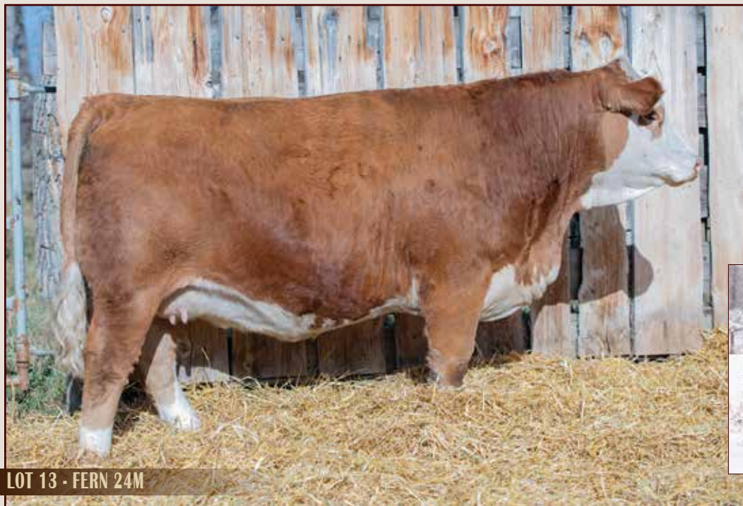
LOT 13 - FERN 24M