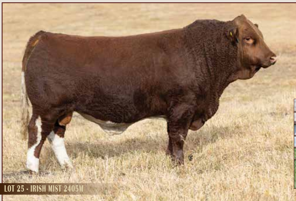
LOT 25 - IRISH MIST 2405M