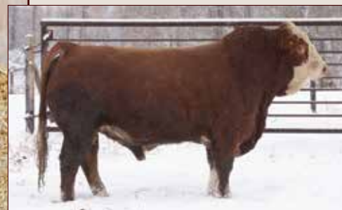
MAVV JOSHUA 133J - Sire of Lot 12 - 14

A-I bred Crossroad Pilot April 4, 2025. Exposed to MTV Maurey 5L April 20 – June 28, 2025. Ultrasound safe to A-I on June 9th.