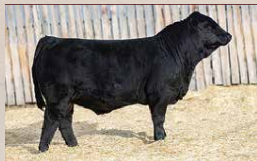
JLD CAPACITOR 1K - Full Sibling to JLD Mary Lou 6L (Dam of Lot 53)