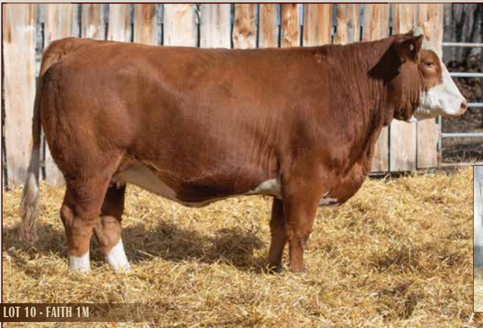
LOT 10 - FAITH 1M