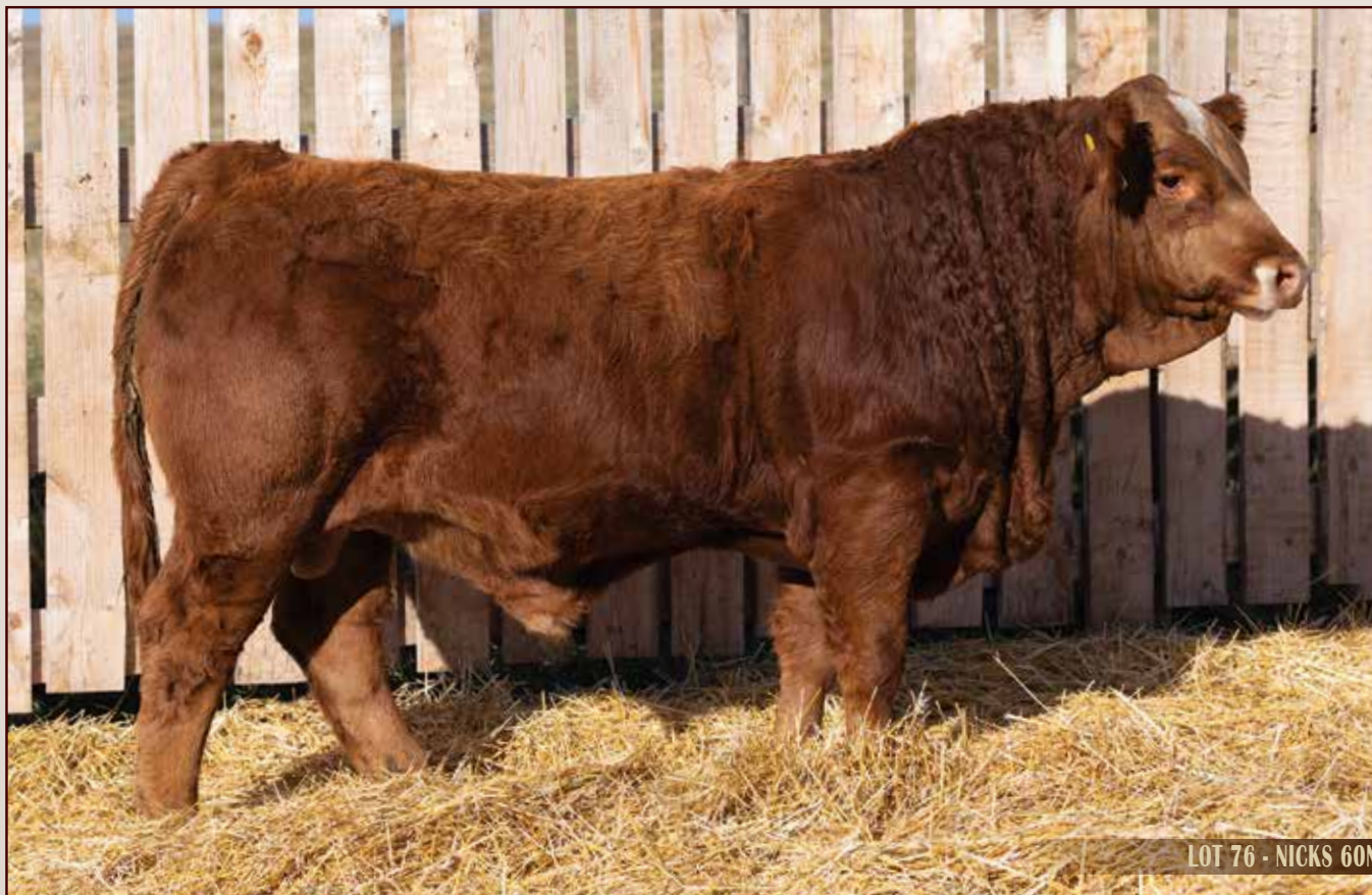
LOT 76 - NICKS 60N