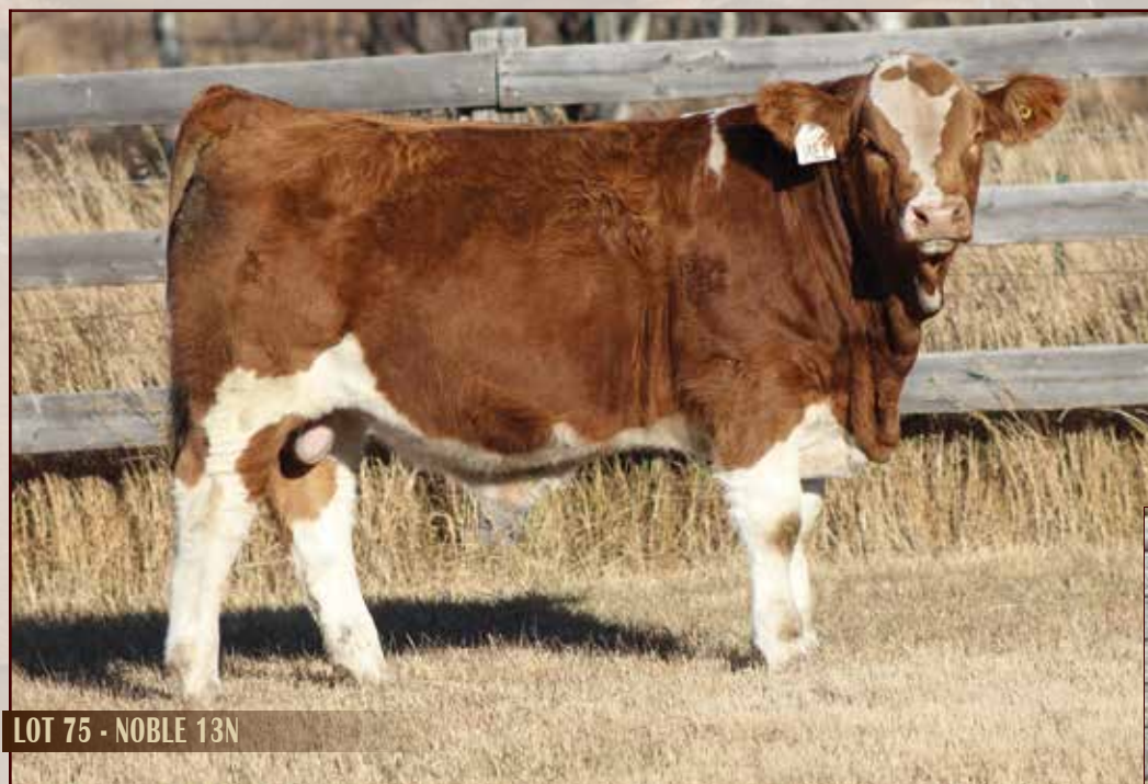
LOT 75 - NOBLE 13N

KEET'S DYNAMIC 20D XRC DOMINIQUE 19D JNR EXXON BIG SKY GINGY 41U JNR'S CONCEPT JNR SHELAIN DOUBLE BAR D SPITFIRE 20X IPU MS. ROWEENA 135X