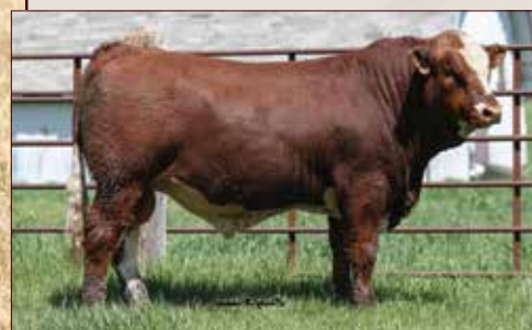
CCRS AMERICAN ICE - Sire of Lots 25 and 26

Polled, and as red as they get, Irish Mist is a product of a powerful top side of his pedigree with notable sires and dams alike. His maternal line is well known here for both longevity and production alike. Ready, willing and able to cover ground and cows alike next spring.