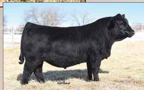
HOOK'S EAGLE 6E - Sire of Lot 27

TNG MAGNUM 6M is an easy bull to like. He's deep-ribbed, tidy fronted, and has that soft, easy-doing look that makes him super practical. He's sired by Hook's Eagle 6E, a bull known for making cattle that are sound, quiet, and easy to keep. His dam, 37F, is a daughter of Dikemans Double Down 26W, bringing that dependable, maternal longevity we really value. If you want daughters that raise calves every year without the drama, 6M is the kind you build around.