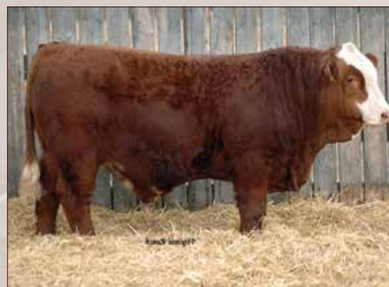
VIRGINIA BEEZER 21F Maternal Grand sire of Lots 40, 41, 44, 45, 48 and 52

SIBELLE SPARTACUS 8A SIBELLE POL CROCUS 20D DOUBLE BAR D BANKER VIRGINIA ABBY 302A BLACK GOLD CRUDE JKL MISS CASSIDY 21C VIRGINIA PREMIERLEAGUE MJB TESA 10T