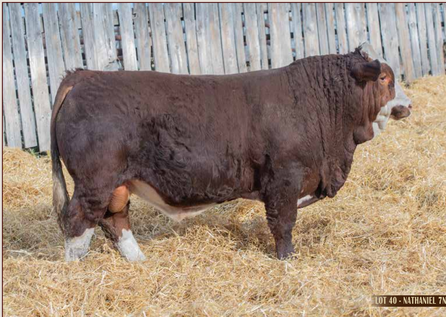
LOT 40 - NATHANIEL 7N