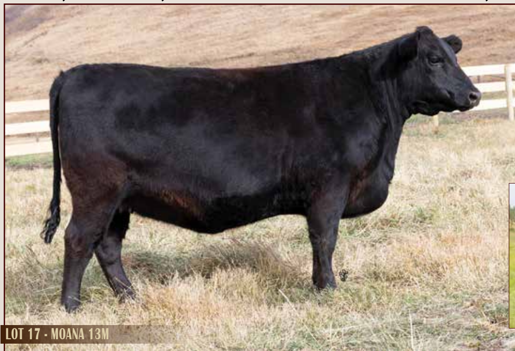
LOT 17 - MOANA 13M

TNG MOANA 13M is a smooth-made, feminine heifer with a broody look and lots of future cow power. Sired by Poss Winchester, she carries his reputation for structural correctness and strong maternal traits. Her dam line has been reliable and long-lasting here.