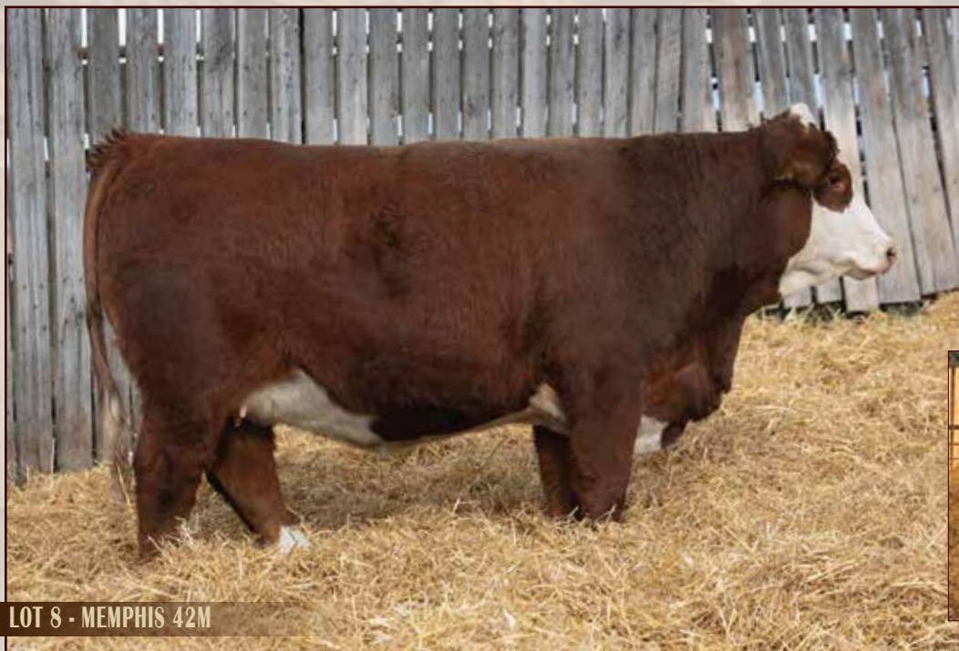
LOT 8 - MEMPHIS 42M

CHAMPS ROMANO VIRGINIA'S MS WEST PATTY DOUBLE BAR D MP 190U BEL ERIKA 43M