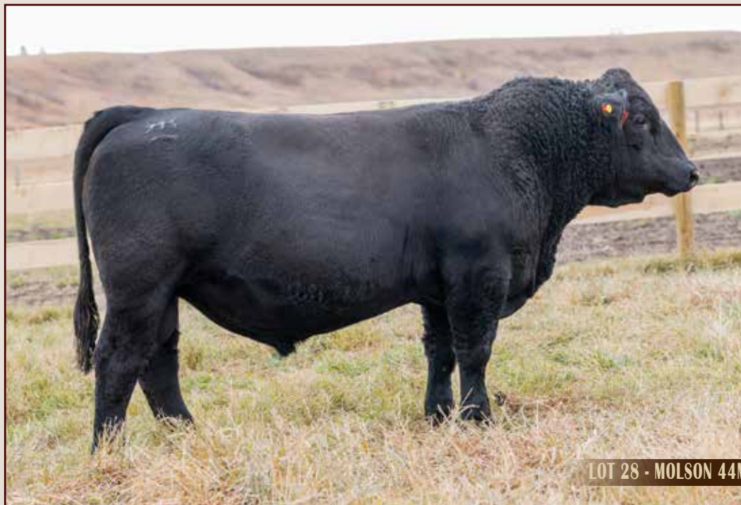
LOT 28 - MOLSON 44M