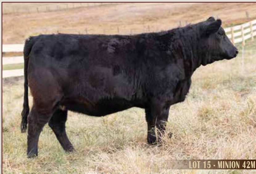
LOT 15 - MINION 42M

Brenda & Brekell Otto 120- 32011 354 Ave W Foothills, AB T1S 7A1 Brenda Cell: 403-818-3142 Brekell Cell: 403-312-9799 Email: BOtto@trranch.ca