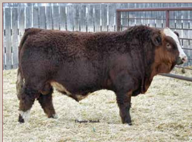
VIRGINIA DIRTY-HANDS 723J Sire of Lots 40, 41, 44, 46, 47 and 51

SIBELLE SPARTACUS 8A SIBELLE POL CROCUS 20D DOUBLE BAR D BANKER VIRGINIA ABBY 302A BLACK GOLD CRUDE JKL MISS CASSIDY 21C VIRGINIA VADER 16B MI MS XYLOPHONE 25X