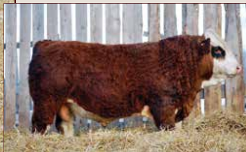
BEE NORSE 46D - Maternal Grand sire of Lot 65, 66 and 67