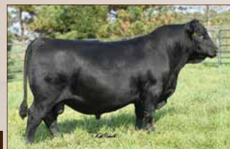
POSS WINCHESTER - Sire of Lot 36 - 39

TNG MAGNUS 24M brings a really attractive profile — neat fronted, good footed and correct through his structure. He's got that Winchester muscle shape but still keeps a clean, extended look through his shoulder and neck. His dam comes from the Eona cow family, a group known for feminine, long-lasting cows with great udder quality. 24M is a bull that checks a lot of boxes for both replacement females and market calves.