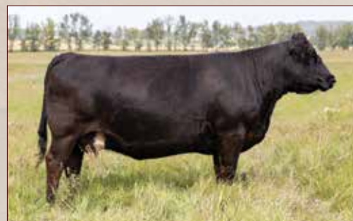
R AND R MILKMAID SMTR 37F - Dam of Lot 27