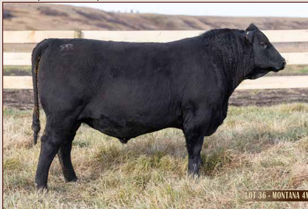
LOT 36 - MONTANA 4M

TNG MONTANA 4M is a long-bodied, smooth-made bull that's really easy to appreciate the more you look at him. He's got that laid-back, good-minded demeanor and travels clean and true. His dam comes out of the Joette cow family, which is known for fertile, hardworking females that simply get it done. A great option for building a dependable, no-fuss cow herd.