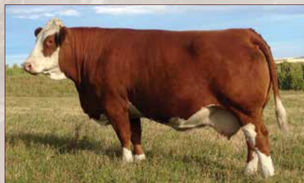
BROCK SAMARA - Granddam of JB CDN SOLDIER 2426