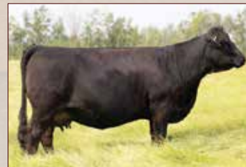
R AND R MILKMAID SMTR 26E Dam of Lot 16

AI Bred on June 5 th to WLE UNO MAS X549 (CSA 1141301) Confirmed safe. Due Date: March 14 th 2026