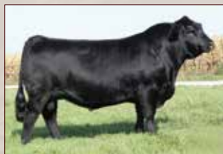
WLE UNO MAS X549 Service Sire of Lots 15 and 16

AI Bred on June 5 th to WLE UNO MAS X549 (CSA 1141301) Confirmed safe. Due Date: March 14 th 2026