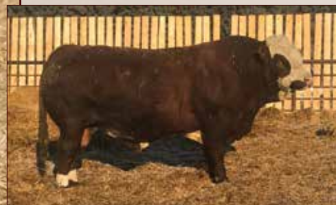
BEE BATTLE CRY 282B - Service Sire of Lot 6 and 8

AI bred BEE Battle Cry 282B-113546- March 27,2025. Exposed MJB Lucas 24L-1440767- April 11-June 01,2025. Confirmed pregnant to AI breeding.