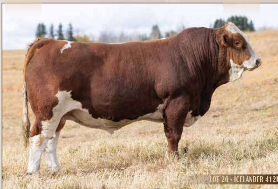
LOT 26 - ICELANDER 412M

DFM MARCUS 14M PAR BLUME 373N FSS MAXIMUS BROCK SAMARA