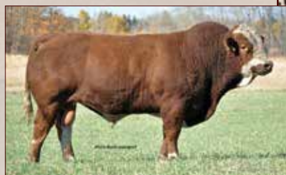
VIRGINIA RUSH 010K - Sire of Lot 42