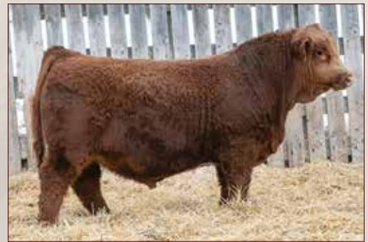
IPU 1G POTENT 17K - Sire of Lot 19, 20 and 21

This heifer's mother was purchased out of the Tymarc Simmentals Dispersal as an open heifer. We also have a full sister in herd that will be calving in January. Had we not had that full sister, we wouldn't likely be selling this heifer. Her mother is a moderate framed cow with a really nice udder and super disposition. This heifer is a deep bodied, super thick and a very feminine girl. She will definitely catch your eye sale day.