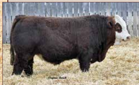
VIRGINIA FULL-TILT 530J - Sire of Lots 6 - 8

AI bred to BEE Battle Cry 282B-113546- March 27,2025. Exposed MJB Lucas 24L-1440767- April 11-June 01,2025. Confirmed pregnant to AI breeding.