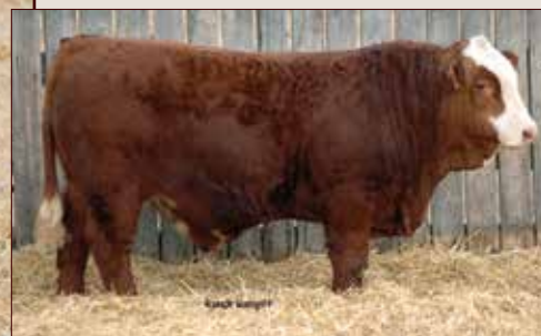
VIRGINIA BEEZER 21F - Sire of Lot 3 and 4

AI bred to Virginia Radison 5Z -773557- March 27,2025. Exposed to MJB Lucas 24L-1440767 April 11 - June 01,2025. Pregnant to AI breeding.