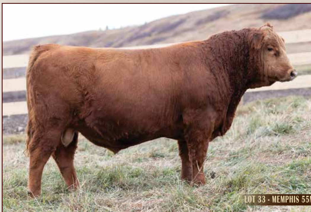
LOT 33 - MEMPHIS 55M