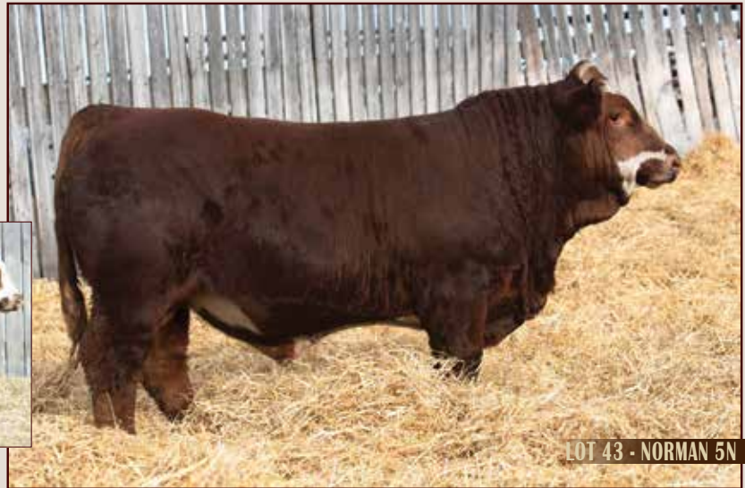
LOT 43 - NORMAN 5N