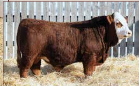
APLX COACH 37J - Sire of Lot 68