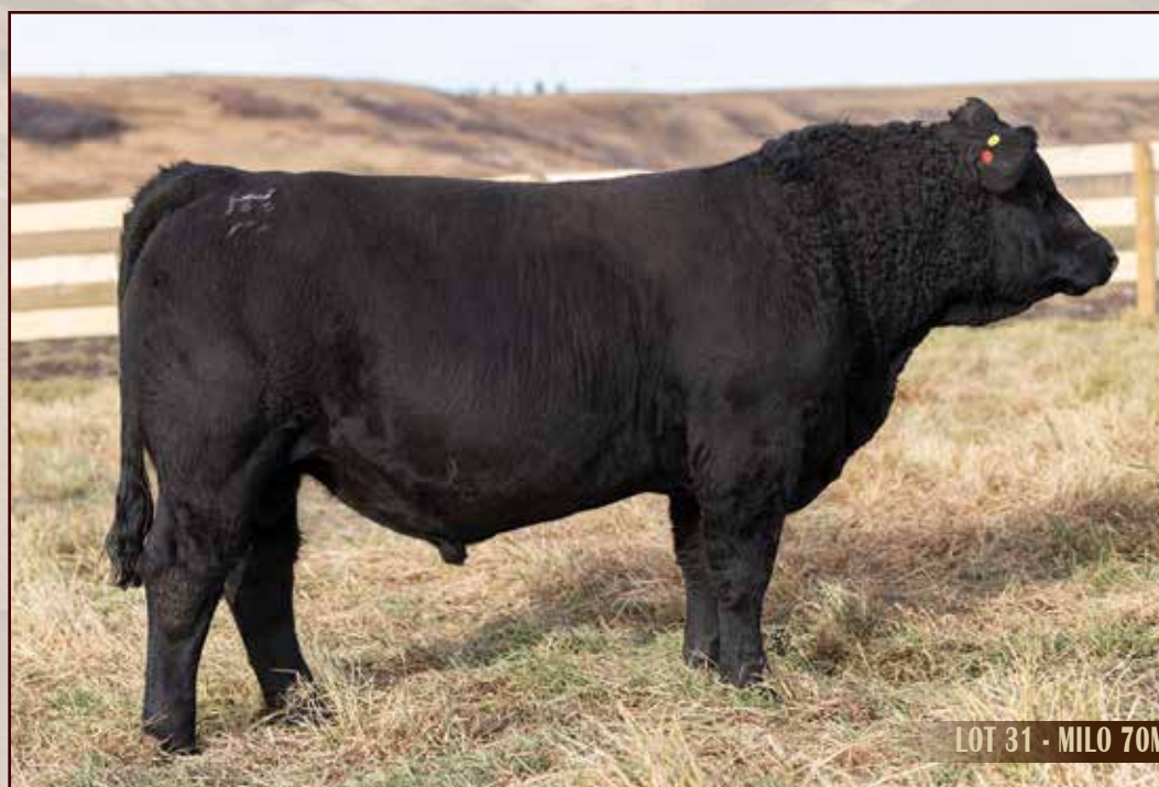
LOT 31 - MILO 70M

WS ALL-AROUND Z35 WS LITTLE SISTER W37 TRAXS RUSHMORE X103 R AND R MILKMAID SMTR 24D