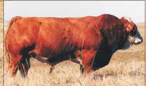
BEL STEWARD 2ND - Service Sire of Lot 1 and 4

AI bred to BEL Steward 2nd -354007- March 27,2025. Exposed to MJB Lucas 24L-1440767 April 11-June 09,2025. Pregnant to AI breeding.