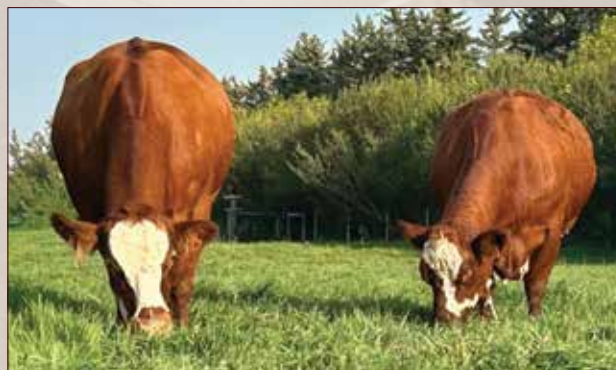
JB CDN FIESTA 1491 (left) and JB CDN FELICITY 1603 (right) Maternal Granddam and Dam of JB CDN THE NASH 2414