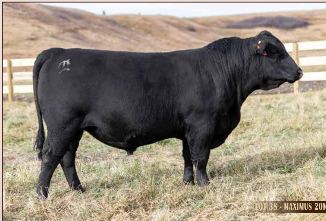
LOT 38 - MAXIMUS 20M

TNG MAXIMUS 20M is a deep-bodied, soggy bull with lots of shape and muscle expression. He's the kind that's easy to feed and easy to like — wide based, stout hipped and soft through the middle. His dam ties into the Emulota cow family, which is known for productive cows that raise big calves and breed back consistently. A strong option if you want power without giving up maternal.