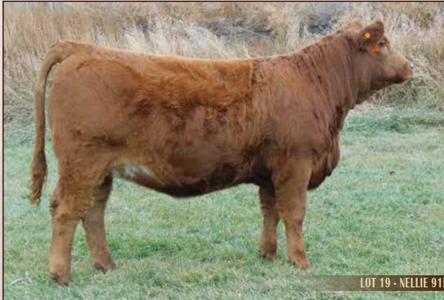
LOT 19 - NELLIE 91N