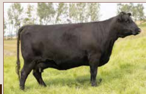
R & R MILKMAID ANTR 45H - Dam of Lot 36

TNG MONTANA 4M is a long-bodied, smooth-made bull that's really easy to appreciate the more you look at him. He's got that laid-back, good-minded demeanor and travels clean and true. His dam comes out of the Joette cow family, which is known for fertile, hardworking females that simply get it done. A great option for building a dependable, no-fuss cow herd.