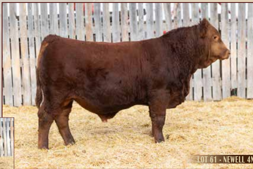
LOT 61 - NEWELL 4N

MRL RED WHISKEY 101B SVS RED SARA 92X ACS EVERREADY 970W 3D MISS RED NOREMAC 211U LFE THE RIDDLER 323B LFE BS VIOLET 641A LCHMN BODYBUILDER 7303F CITY VIEW XCELLENCE 18X