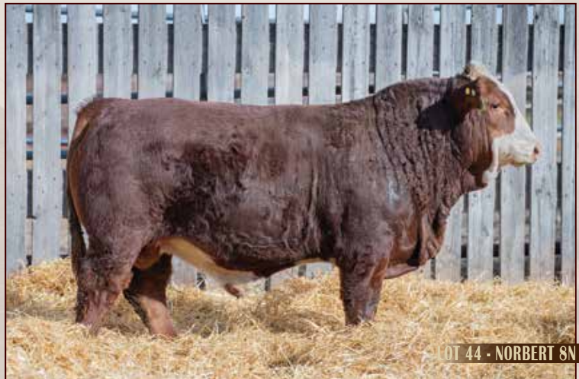
LOT 44 - NORBERT 8N

Norbert is a Virginia Dirty Hands 723J son out of a Virginia Beezer 21F dam. He has a dark red solid colored body. He is thick and has well developed testicles. WWT 930 pounds ADJWWT 815 pounds