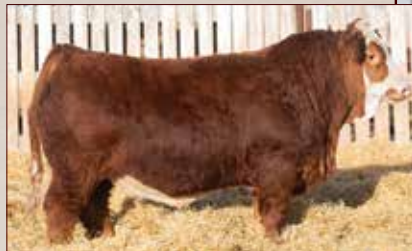
WJS ONE UP 21L - Sire of Lot 45 and 49

This is a WJS One Up 21L son (a junior herd sire Brian bought last spring). He is smooth headed, red, solid colored, with small goggles and good testicular development. DS Virginia Beezer 21F. WWT 820 pounds ADJWWT 727 pounds