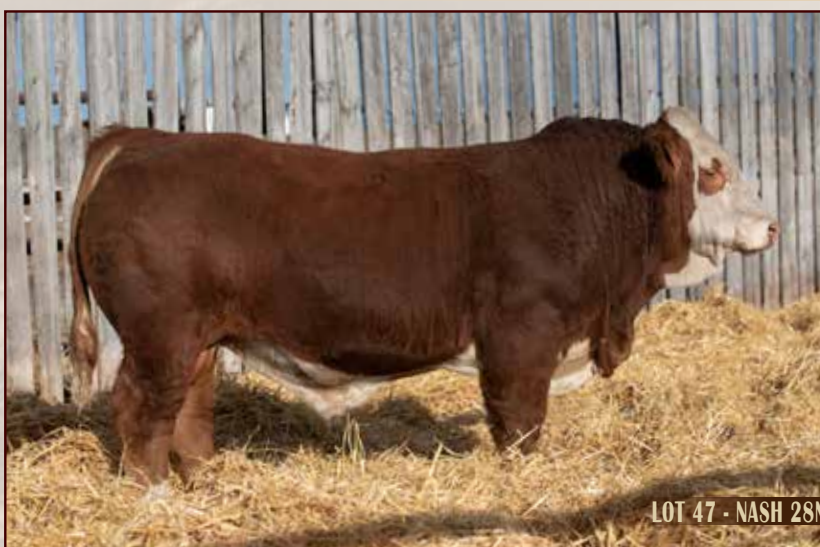
LOT 47 - NASH 28N

1514596 / JKL 28N / Jan 16, 2025 / Fullblood