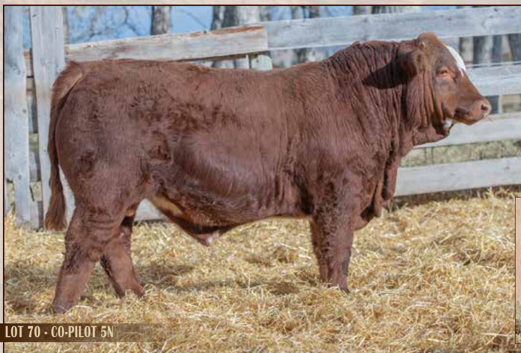
LOT 70 - CO-PILOT 5N

BEE PHANTOM 79B STARWEST POL ARIEL CROSSROAD TUXEDO 222T CROSSROAD STARLA 473S SIBELLE DIRTY HARRY 25Z MTV URSULA 9D BEE NORSE 46D MVS MARIE