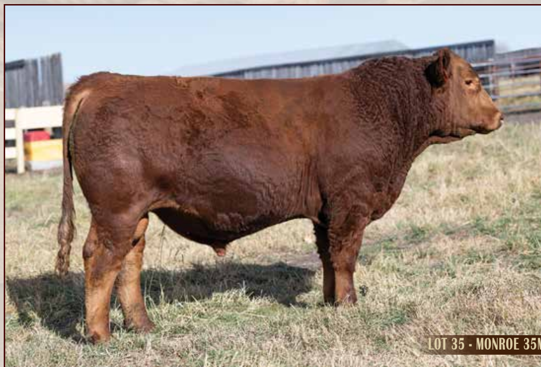
LOT 35 - MONROE 35M