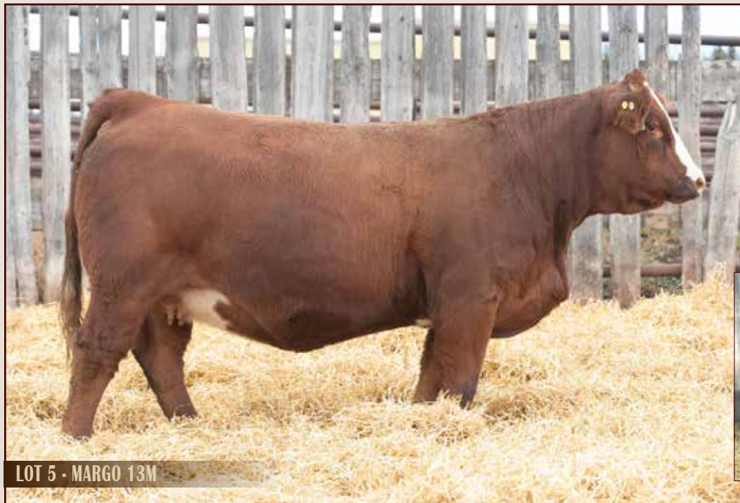
LOT 5 - MARGO 13M