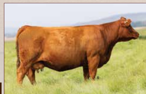
R AND R MILKMAID SMTR 1G - Dam of Lot 33

TNG MEMPHIS 55M is a big, soft, easy-going red bull that's real easy to appreciate. He's deep through his middle, wide over the top and has that chill, workable attitude we all like. His dam traces back to Traxs Rushmore X103, which is where that extra rib shape and "good momma cow" look comes from. If you're wanting daughters that stay feminine, hold their condition and quietly do their job, Memphis is your guy.