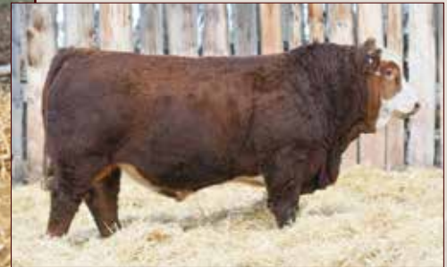
MTV KARLSBURG 3J - Sire of Lot 9, 10

A-I bred Virginia Radison April 4th, 2025. Exposed to MTV Maurey 5L April 20 – June 28th. Ultrasound safe to A-I date on June 9th.