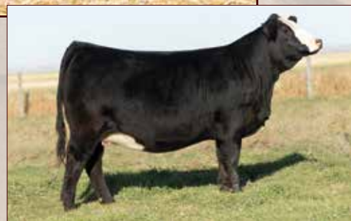
JLD MARY LOU 6L - Dam of Lot 53

A true performance bull that checks every box — power, presence, and predictability. An IVF ET calf that came with a little extra birthweight as the IVF calves usually do. But we are confident that this is not how this bull will breed. This late January calf's sire Caliber, a bull who truly needs no introduction for his ability to stamp consistency, muscle, and style into his progeny. Out of a no-miss cow family that continues to raise the right kind year after year, he's long-bodied, extremely stout, and built like a herd bull should be. Add in a neat blaze face and a quiet, easy-going temperament, and he's the kind you'll want to build around. Backed by a proven pedigree and impressive performance, this Caliber son blends look and power very well. We would like to retain in herd use semen on this bull at our expense & buyer convenience.