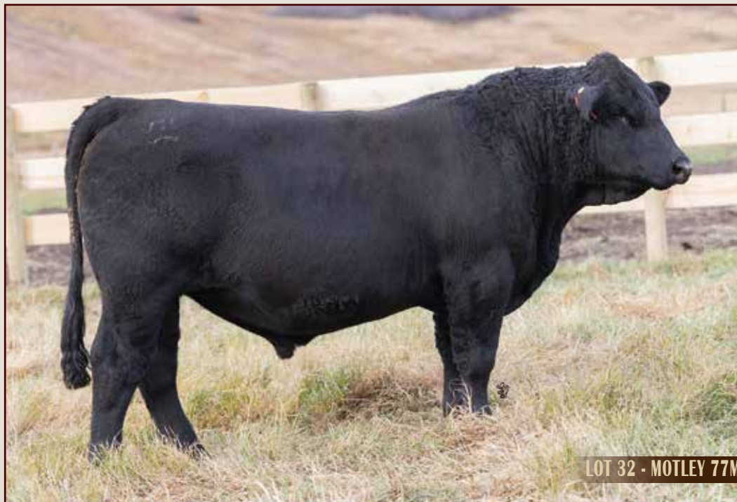
LOT 32 - MOTLEY 77M