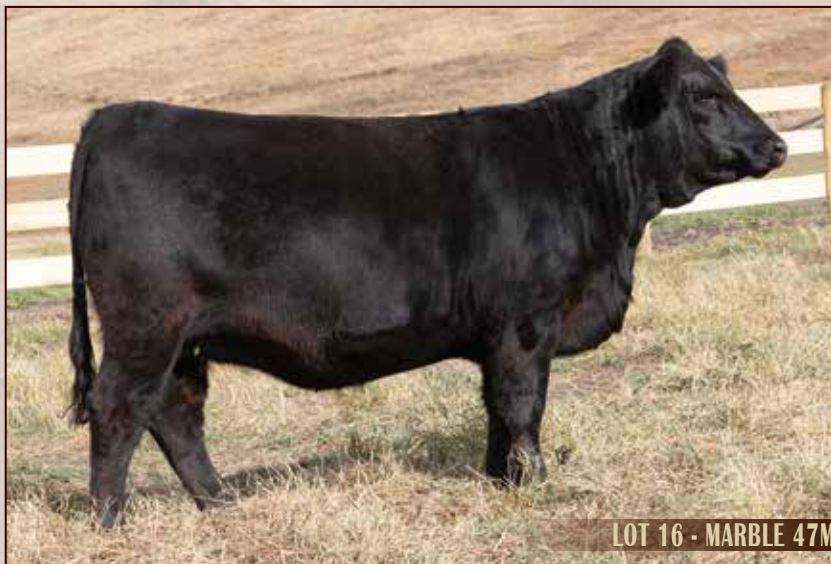
LOT 16 - MARBLE 47M

TRIPLE C SINGLETARY S3H CCR MS 4045 TIME 7322T CLRS GRADE-A 875 A WS ANISE A71 DIKEMANS SURE BET NATASHA 10N HUNT MR JOCK 44J R&R MILKMAID 15M