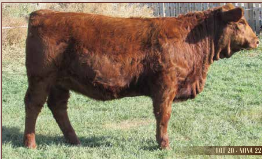
LOT 20 - NONA 22N

MADER THE RINGER 59C MCG ELECTRA 22E MCG ALBERTA 19A MRL GAME CHANGER 12A MADER P MALIBU 40W J ANCHOR BEEF MAKER 4X MCG XYLOMA 20X