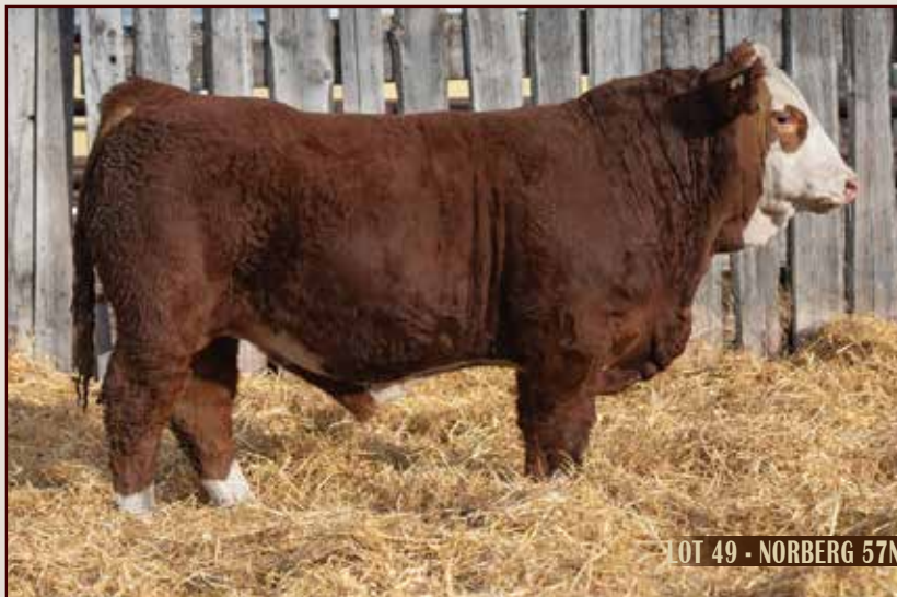
LOT 49 - NORBERG 57N

P1520345 / MJB 57N / Feb 2, 2025 / Polled Fullblood