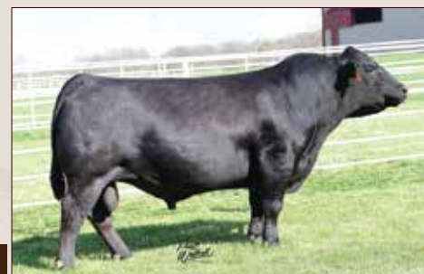
WS PROCLAMATION E202 - Sire of Lot 28

TNG MOLSON 44M is a soft-made, easy fleshing bull with lots of shape and middle. Sired by WS Proclamation E202, he carries the balance, structure, and maternal strength that Proclamation is known for. His dam, 23B, traces back to Dikemans Sure Bet, a cow family known for strong udders, good feet and cows that stay in the herd. He's big-barreled, sound-footed and a naturally easy bull to appreciate. Expect him to add body, structure and longevity to your herd.