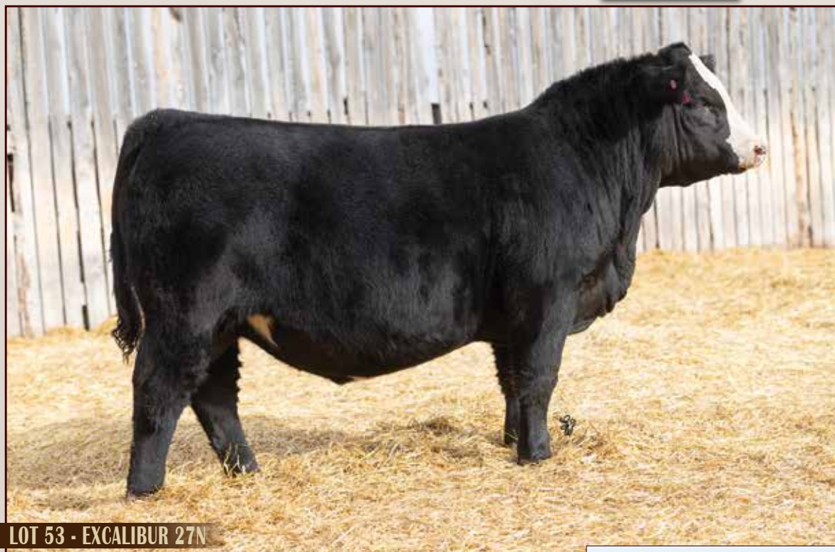
LOT 53 - EXCALIBUR 27N