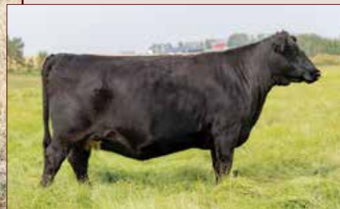
R & R MILKMAID ANTR 19J - Dam of Lot 17

AI Bred on June 5 th to SCHIEFELBEIN TOP GUN 522 (CAA 2406165) Confirmed safe. Due Date: March 14 th 2026