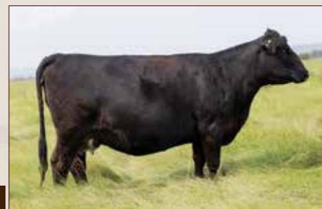
R AND R MILKMAID SMTR 21H - Sire of Lot 32

TNG MOTLEY 77M is a good, honest bull. He's deep sided, wide over his top, and carries himself the way one should. A really balanced bull that holds together wherever you look at him. Both sides of his pedigree go back to Hooks Shear Force 38K and CCR Cowboy Cut 5048Z, so there's generations of structure, disposition, and maternal consistency stacked into him. His dam, 21H, is exactly the type you love to have around — tidy udder, stays in great shape, and just goes to work every year without needing any fuss.