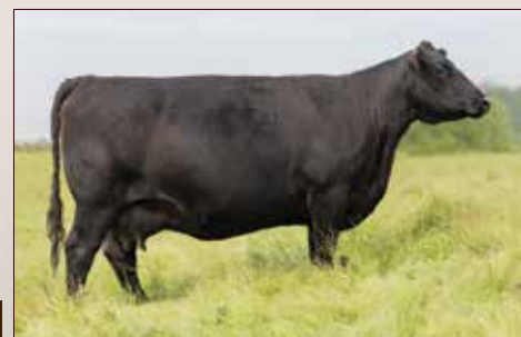
R&R MILKMAID ANTR 30H - Dam of Lot 38

TNG MAXIMUS 20M is a deep-bodied, soggy bull with lots of shape and muscle expression. He's the kind that's easy to feed and easy to like — wide based, stout hipped and soft through the middle. His dam ties into the Emulota cow family, which is known for productive cows that raise big calves and breed back consistently. A strong option if you want power without giving up maternal.