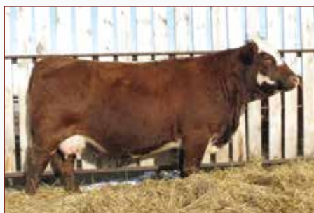
FAIRVIEW QUEEN 418H - Full Sister