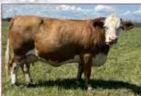
SANMAR EMILY 2E Daughter of PHARO 12P

The Polled, Calving Ease, Non-Dilutor specialist out of ABR Arnold's Image x Sanmar Pol Teardrop 12M.