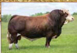
SILVER LAKE JACKSON 24J Sold for $155,000 - Son

Darwin is a smooth polled, 100% Fleckvieh, cherry red, non-dilutor, moderate frame and heavy muscle bull with really good feet. Unfortunately, Darwin died at stud just after the quarantine, so we have around 60 doses left. For that reason, we only sold few doses every year and only few calves are born every year in Canada. His progeny is very well accepted by the industry and he produce some of the high seller across Canada, male and female every year.