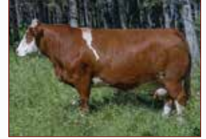
WOLFES DARA FF11D