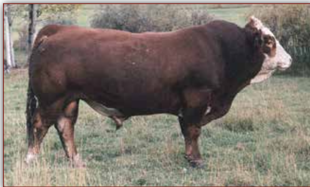
GREAT GUNS KARL 17C

CE 5.6 BW 4.7 WW 70.6 YW 94.5 M 35.0 MCE 4.4 MWWT 70.3