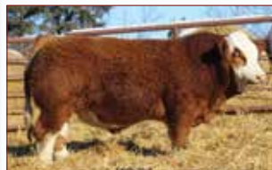
SIBELLE NITRO Sold to EHR Simmentals for $14,000