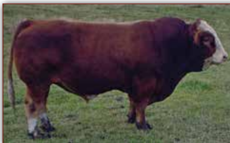
PRL HOUSTON 005H

CE 2.2 BW 5.3 WW 70.6 YW 98.2 M 20.8 MCE 0.0 MWWT 56.1