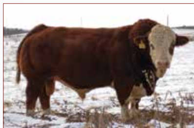
SIBELLE SPARTACUS 8A Sire of SIBELLE POL SYNERGY 18F