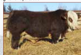
SIBELLE POL DARWIN 21F Son of Spartacus