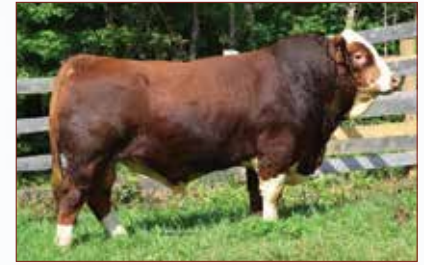
ANCHOR D RAPTOR 392C Sire of JB CDN BLACKFOOT CROSSING 2332