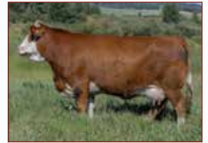
WOLFES FAY FF93F