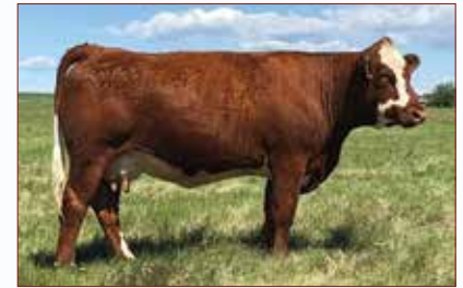
JB CDN FELICITY 1603 Dam of JB CDN BLACKFOOT CROSSING 2332