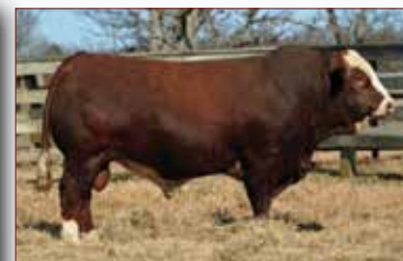
WILLOW OAKS INTREPID G8 Sire of ROD SWEET VINNY 86L