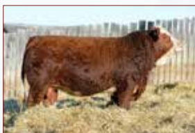
Son of SANMAR POLLED PHARAO 12P