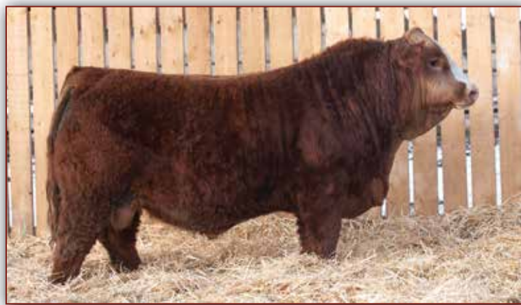
BEE ALPHA 915J

CE 7.0 BW 3.8 WW 87.8 YW 122.3 M 21.1 MCE 6.9 MWWT 65.0