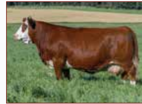
WOLFES HELGA FF55F