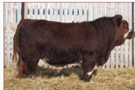
FAIRVIEW VELOCITY 63M - Son