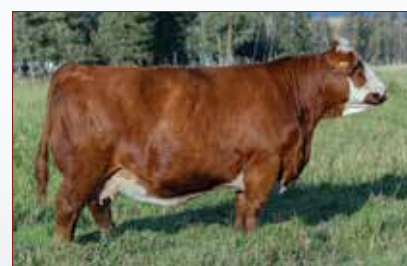
RUK MS CAPRI 1C - Dam of JNR BARBARIAN