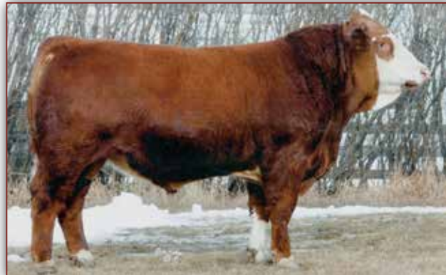
BHR DOORN G629E