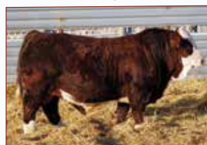
RWR DARWIN 79M Sold for $45,000 - Son