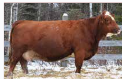
GIBBONS DORALEE Dam of FGAF ELECTRIC AVENUE 140E