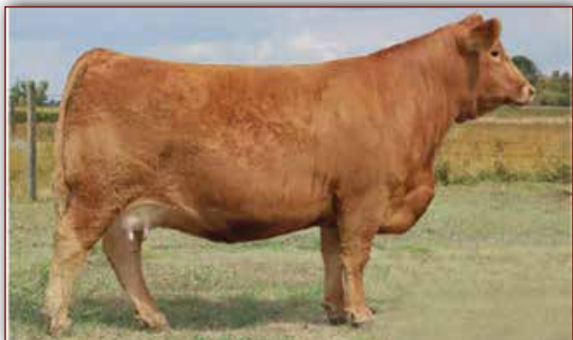
LFE RED CASINO 3036X

CE -0.5 BW 8.3 WW 89.9 YW 130.5 M 22.6 MCE -2.1 MWWT 67.6