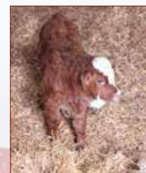
First Calving Male Calf at 2 Weeks