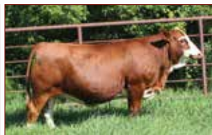
SIBELLE POL PEGGY 5M Sold to Rich MC Simmentals for $37,500