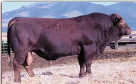
3C WALLY C240 BLK

CE 3.3 BW 6.0 WW 77.3 YW 127.3 M 23.2 MCE -4.2 MWWT 61.9