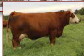
SIBELLE DELTA 34C Daughter of Spartacus

30 Straws 14A) 10 STRAWS 14B) 10 STRAWS 14C) 10 STRAWS