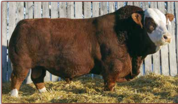
MFI WHISTLER 47L

CE 6.8 BW 5.0 WW 76.1 YW 100.5 M 40.1 MCE 2.3 MWWT 78.2