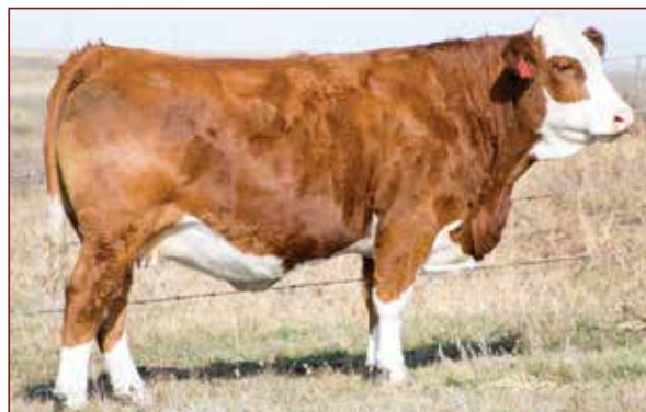
JB CDN WIND WALKER 1102