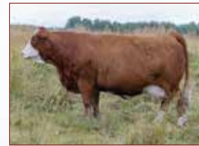
JNR'S GRACEFUL 613C