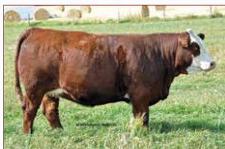
SKYWEST POL JENNY 410M - Daughter Sold for $21,500.00 at Western Harvest 2025