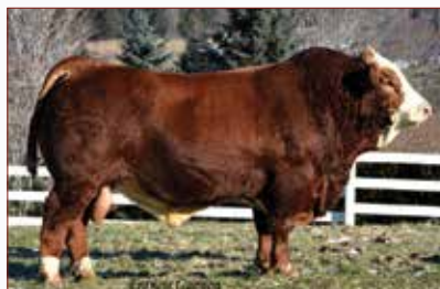
ALLM COLOSSAL 25U Sire of FGAF MAGNUM 901Z