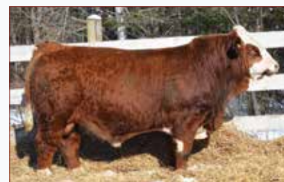
FGAF JUST DO IT 131L - Son Sold to Johnson Ranching