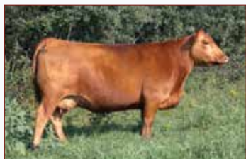
RED MAR MAC REBA 56K Daughter of RED MCRAE'S REBA 49W