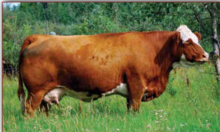
ABR SIR ARNOLDS IMAGE