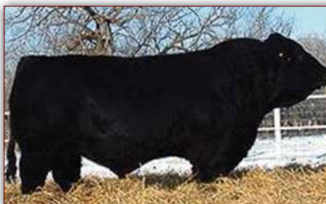
WHEATLAND BULL 131L

CE 5.0 BW 4.4 WW 87.1 YW 127.9 M 25.4 MCE -2.3 MWWT 68.9