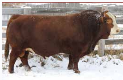
SOUTHSEVEN MR ADONIS 96Z - Sire of LHVS CHARLES 29C