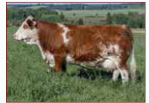
WOLFES JOLENE FF34J