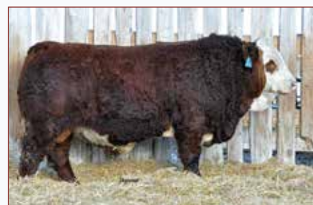
SKYWEST VULCAN 051M - Son Sold for $32,000.00 at Virginia Ranch/Skywest Simmental Bull Sale 2025