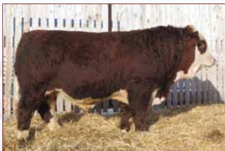
FAIRVIEW FUSION 22L - Son