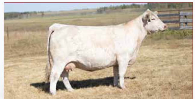
EVF LILY 338L as a cow Daughter of MISS PRAIRIE COVE 10H Full Sibling Mating to Embryos