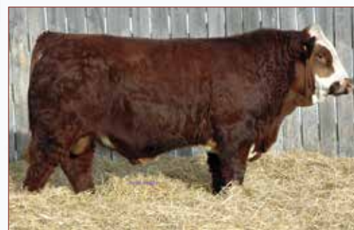
VIRGINIA RADISON 5Z - Sire of VIRGINIA MARQUEE 42D