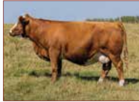
JNR PETRA 544C

COWS LIKE THESE.. Produce Heifer Calves Like This!