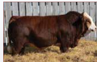
FSMB LOOKOUT 4L Son of CITYVIEW GOLD TRIGGER 76H