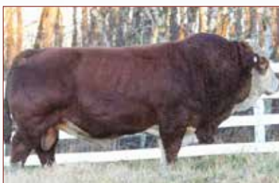
SIBELLE SUGAR RAY 25F - Sire of BLL RUMBLE 62H