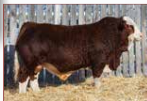
KUNTZ MICHELOB 20L Sold for $60,000 - Son