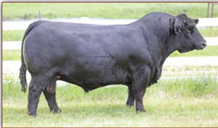
LFE VIPER 455U