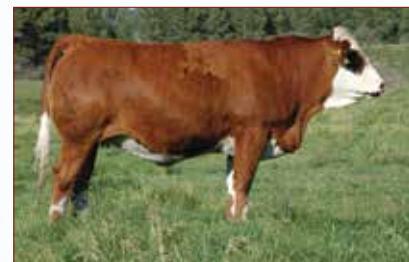
VIRGINIAS UPTOWNGAL Dam of FGAF MAGNUM 901Z