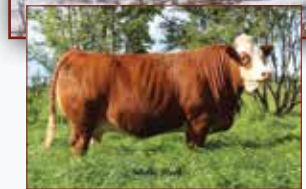
CROSSROAD DELICIOUS 122D Daughter of Spartacus