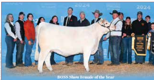
EVF LILY 338L as a bred heifer Daughter of MISS PRAIRIE COVE 10H Full Sibling Mating to Embryos

GUARANTEE - ONE PREGNANCY ON 3 EMBRYOS IF IMPLANTED BY CERTIFIED TECHNICIAN.