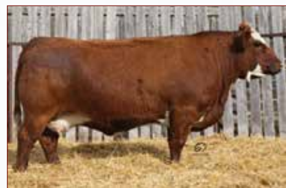
KEATO PLD ELOQUENCE 18E