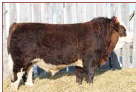
NAC THEORY 169M - Son