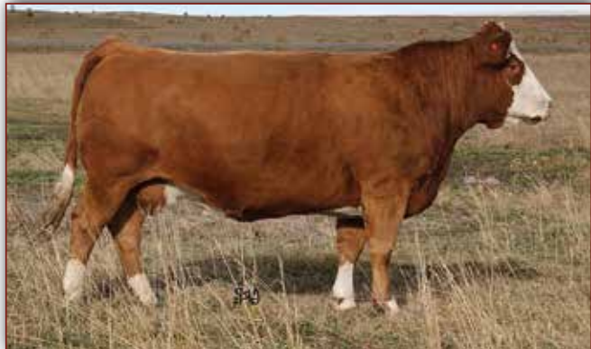
SHAWACRES JAHARI 50L

Canadian Qualified. Stored at Davis Rairdan.