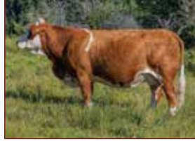
JNR SHAMU 918F