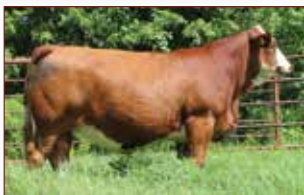
SIBELLE POL AMAZONE 41L Sold to 100X Ranch for $37,000

30 Straws 12A) 10 STRAWS 12B) 10 STRAWS 12C) 10 STRAWS