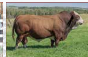
SIBELLE POL SYNERGY 18F Son of Spartacus