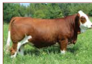
FSMB MEMORY 6M Sold for $20,000 - Daughter