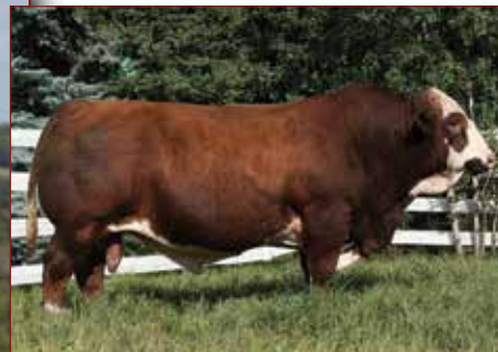
FGAF ELECTRIC AVENUE 140E - Sire of BLL VOLTAGE 64H