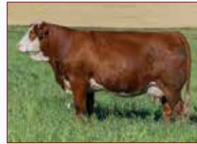
WOLFES JACKIE FF24J