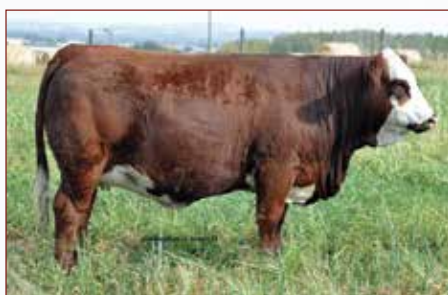
SKYWEST POL MAPLE 472M - Daughter Sold for $32,000.00 at Western Harvest 2025