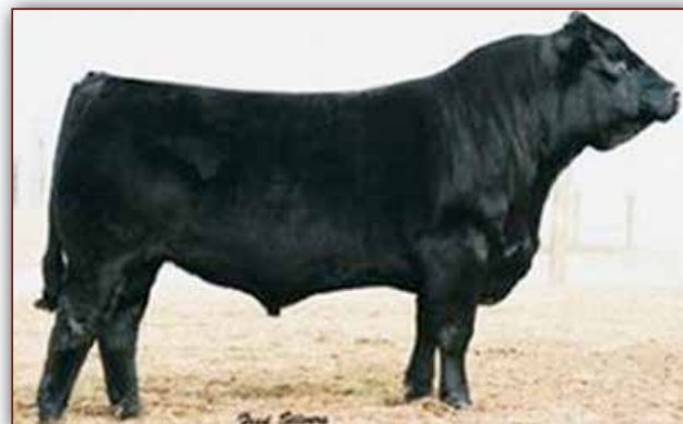
HARTS BLACK CASINO B408