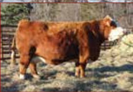
Daughter of Spartacus