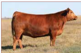
Seneca Daughter out of RED MCRAE'S REBA 49W

This frozen pkg of goodness is truly "The best of both world's " right now in this amazingly strong cattle market we are all enjoying!! With the remarkable Red Angus cow Reba 49W and the unreal female making simmie bull in Cobra.