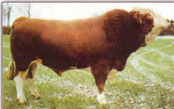
DDD BROADWAY G534

Canadian Qualified. Stored at Alta Genetics.