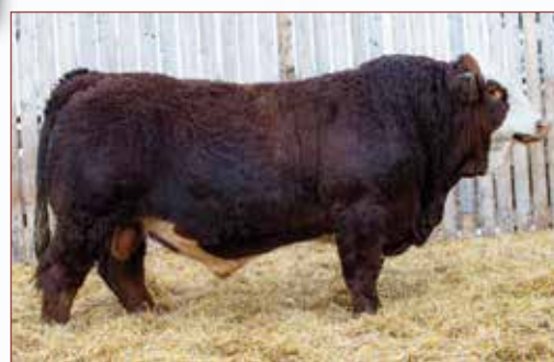
BLL CREED 950G - Sire of Lot 5 and 6