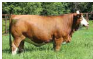
SIBELLE TIFFANY 35L Sold to Rich MC Simmentals for $21,000