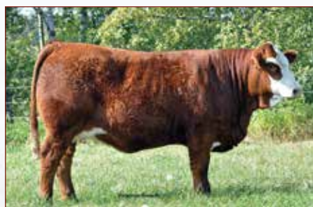
VIRGINIA MEGAN 027M - Daughter Sold for $36,000.00 at Western Harvest 2025