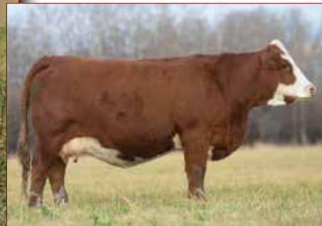
STARWEST POL BESSIE - Dam of BLL VOLTAGE 64H