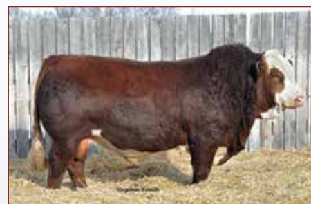
VIRGINIA WESTLOCK 051L - Son Sold for $18,500.00 at Virginia Ranch/Skywest Simmental Bull Sale 2025