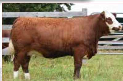
FGAF DUCHESS 112L - Daughter Sold to Bovey Family Farms