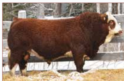
FGAF FRENCH ATTACK 010C Sire of FGAF ELECTRIC AVENUE 140E