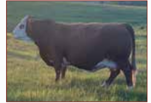
JNR GRACEFUL 410A