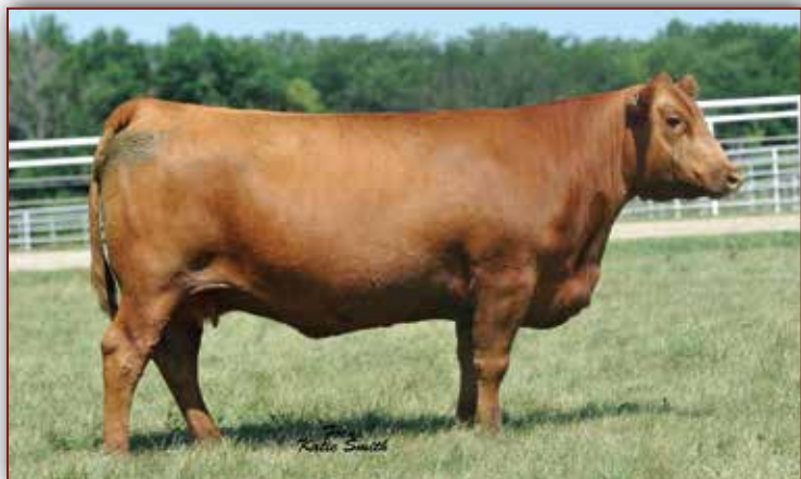
RED 5L GUNFIRE 1173-6966

Canadian & US Qualified. Stored at Davis Rairdan.