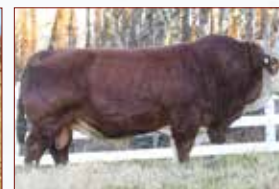
SIBELLE SUGAR RAY 25F Son of Spartacus