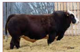
FSMB KEGGER 22K Son of CITYVIEW GOLD TRIGGER 76H

It will be the last occasion you can buy semen from Gold Trigger for the 2025 & 2026 breeding season. Don't miss the opportunity!