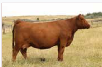
RED BRYLOR OTHC REBA 49D Daughter of RED MCRAE'S REBA 49W

CE 10.1 BW 1.8 WW 82.3 YW 118.6 M 20.5 MCE 8.1 MWWT 61.7