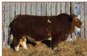
BMS JACKHAMMER Sold to KSL Simmentals for $15,000