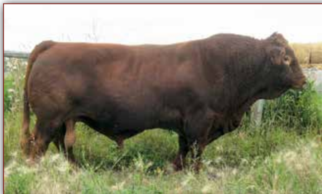
MUIRHEAD LIVE WIRE 95R

CE 5.0 BW 4.4 WW 87.1 YW 127.9 M 25.4 MCE -2.3 MWWT 68.9