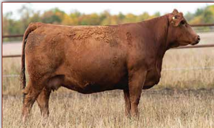
R PLUS VENOM 4006B