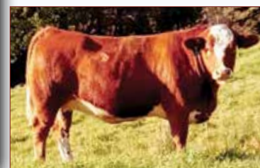
RUGGED R BLOSSOM 1042J Dam of ROD SWEET VINNY 86L