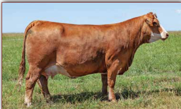
ANCHOR D IMAX 250Y

Canadian Qualified. Stored at Bow Valley Genetics.