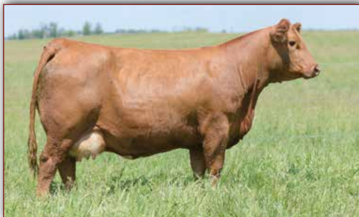
BGS/BM CAPTAIN SCREAM 63D

Canadian & US Qualified. Stored at Davis Rairdan.