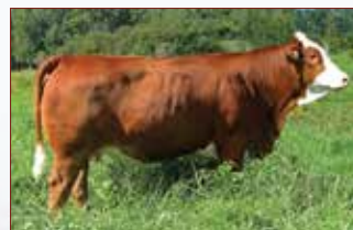
FSMB LITCHI 6L Daughter of CITYVIEW GOLD TRIGGER 76H