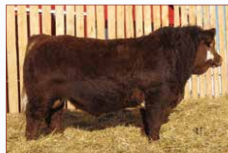
FAIRVIEW MOTION 103K - Son