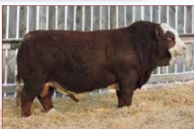
JNR BALDWIN - Sire of JNR BARBARIAN