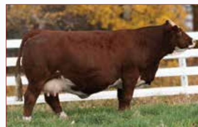
BEE COUTURE 663D - Dam of BLL RUMBLE 62H