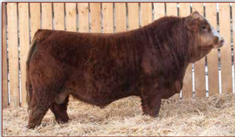
BEE ALPHA 915J

CE 7.9 BW 3.4 WW 91.3 YW 138.1 M 22.5 MCE 2.6 MWWT 68.2