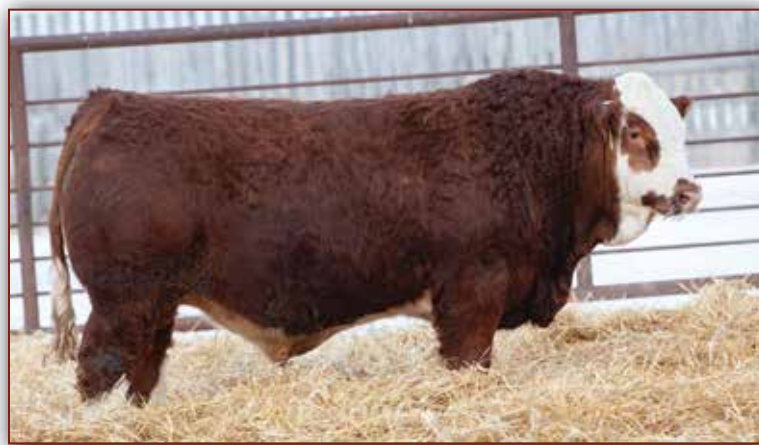
DOUBLE BAR D RIVAL 28D

CE 5.7 BW 4.3 WW 52.9 YW 72.7 M 32.7 MCE -2.9 MWWT 59.2