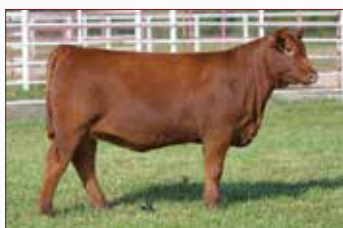
Daughter of RED MCRAE'S REBA 49W