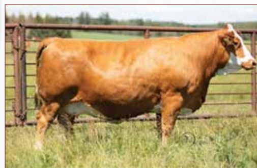
ANCHOR D GARREN'S SHENZI 524G Dam of ANCHOR D GARREN'S KRUSH 524K