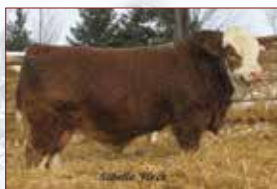
SIBELLE POL GOLIATH 04E Son of Spartacus