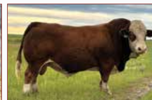
SILVER LAKE JENNER 9J Sold for $50,000 - Son