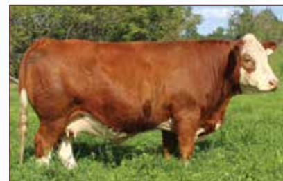
SIBELLE POL CROCUS 20D Dam of SIBELLE POL SYNERGY 18F

Fullblood · 1162088 · VIRS 423D · JAN 06, 2016