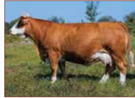
JNR HELGA 572C