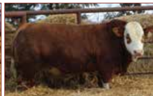
SIBELLE MALTAZAR 2M Sold to Ferme SG Noel for $10,000