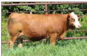
SIBELLE/BMS POL SAPHIRE Sold to Dwayann Simmentals for $25,000