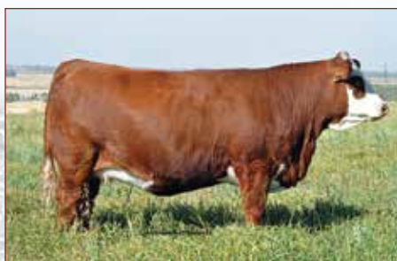
SKYWEST JOICE 441M - Daughter Sold for $28,000.00 at Western Harvest 2025