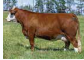
SJWW SHALE FF21K