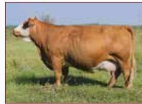
JNR MARTINA 560C