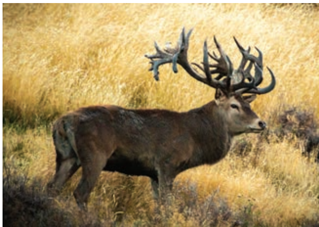
Super Gold SCI 551 - 600