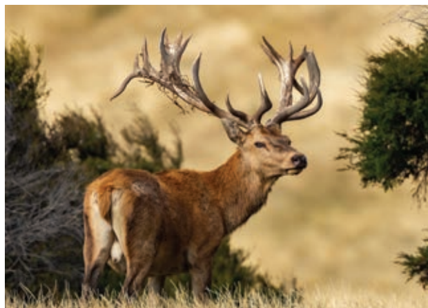
Silver SCI 341 - 380