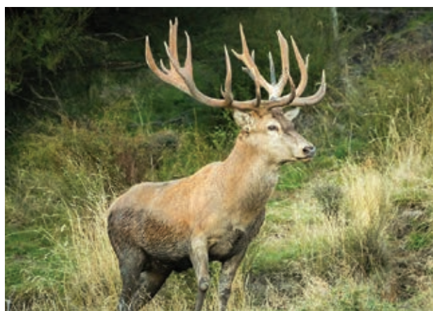
Premium Gold SCI 421- 450