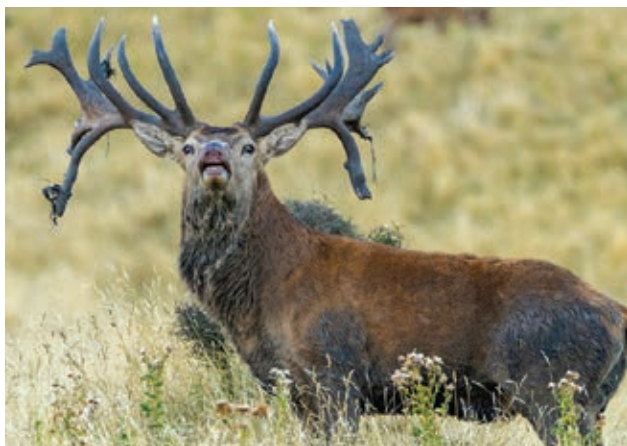
Gold SCI 381 - 420