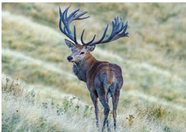
Super Gold SCI 451- 500