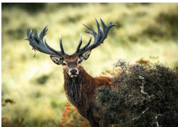
Bronze SCI 280 - 340