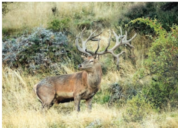
Super Gold SCI 501 - 550