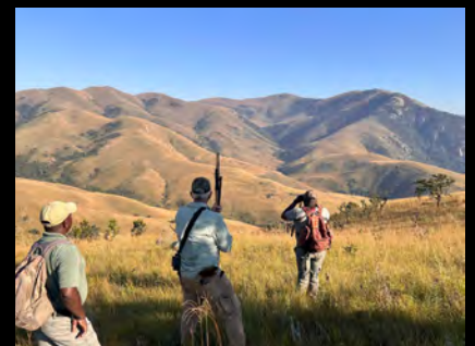
Buffalo hunting in Noisy valley