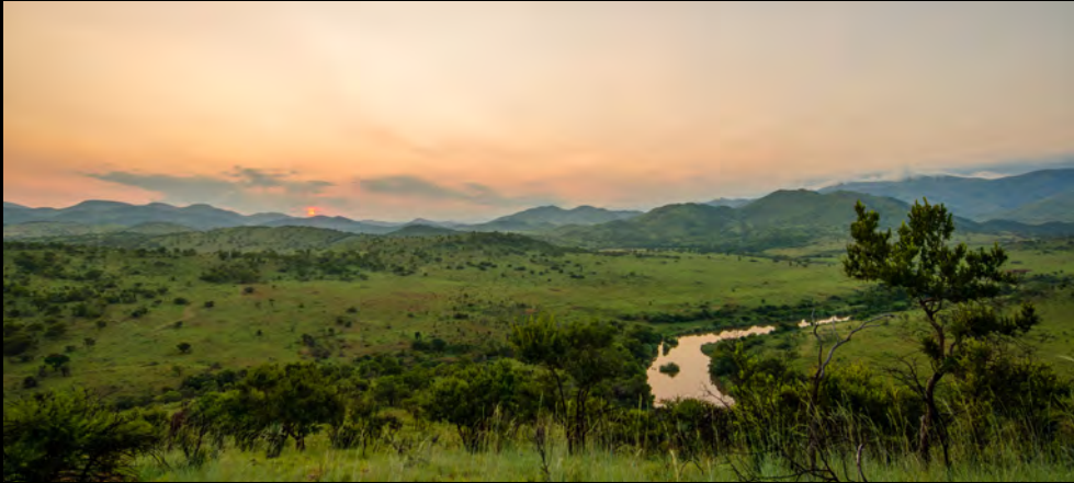
The majestic Komati river that winds through Songimvelo Nature Reserve