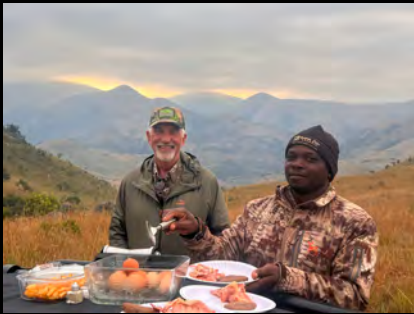
"Sunrise breakfast" in the bush