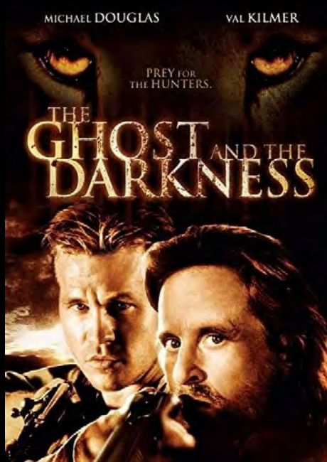
Songimvelo Nature Reserve - location where the film was made.