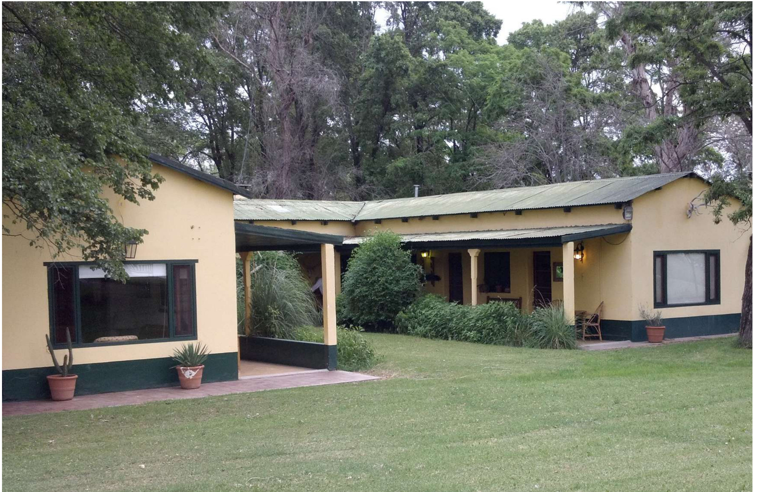
Authentic Argentine hunting ranch in the thick of real free range countryside estate, with dazzling views and amazing nature all around