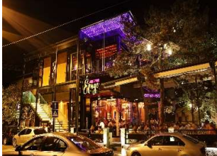
„Voulez Vous Etage“